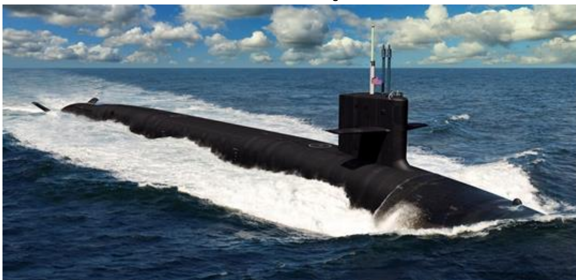
Figure 2. Columbia (SSBN-826) Class SSBN

The Columbia-class design (see Figure 2 and Figure 3 ) includes 16 SLBM tubes, as opposed to 24 SLBM tubes (of which 20 are now used for SLBMs) on Ohio-class SSBNs. Although the Columbia-class design has fewer SLBM tubes than the Ohio-class design, it is larger than the Ohio-class design in terms of submerged displacement. The Columbia-class design, like the Ohio-class design before it, will be the largest submarine ever built by the United States.