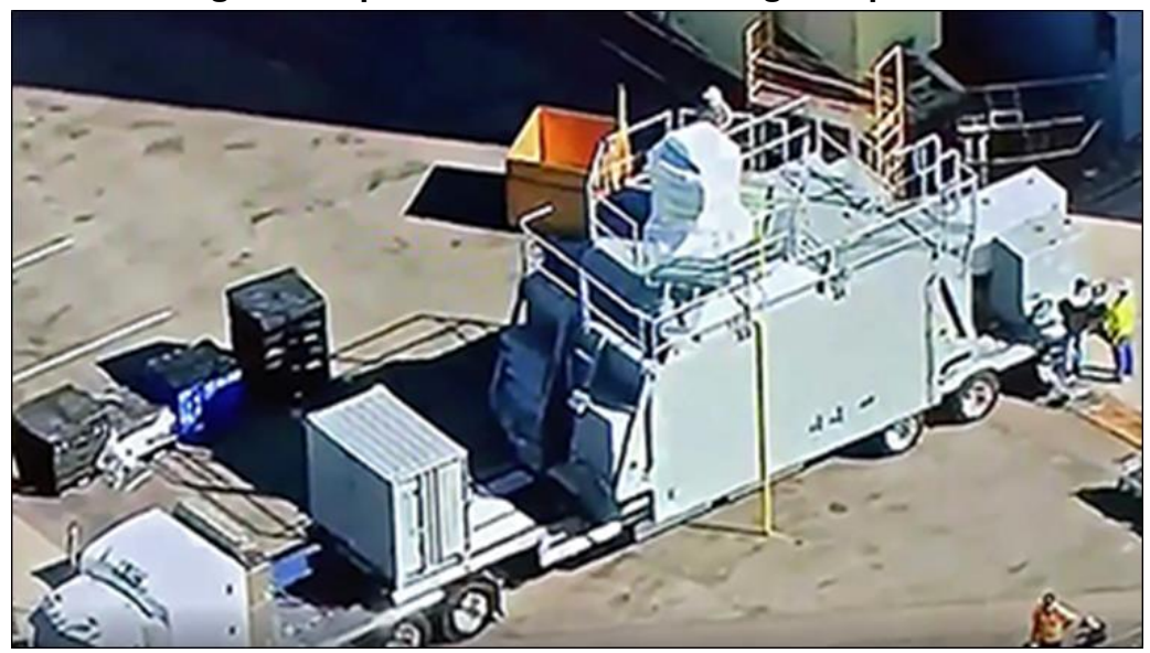
Figure 7. Reported SSL-TM Laser Being Transported

photograph printed in full elsewhere in the blog post. The uncropped version is credited to "Matt Hartman/ShoreAloneFilms.com."