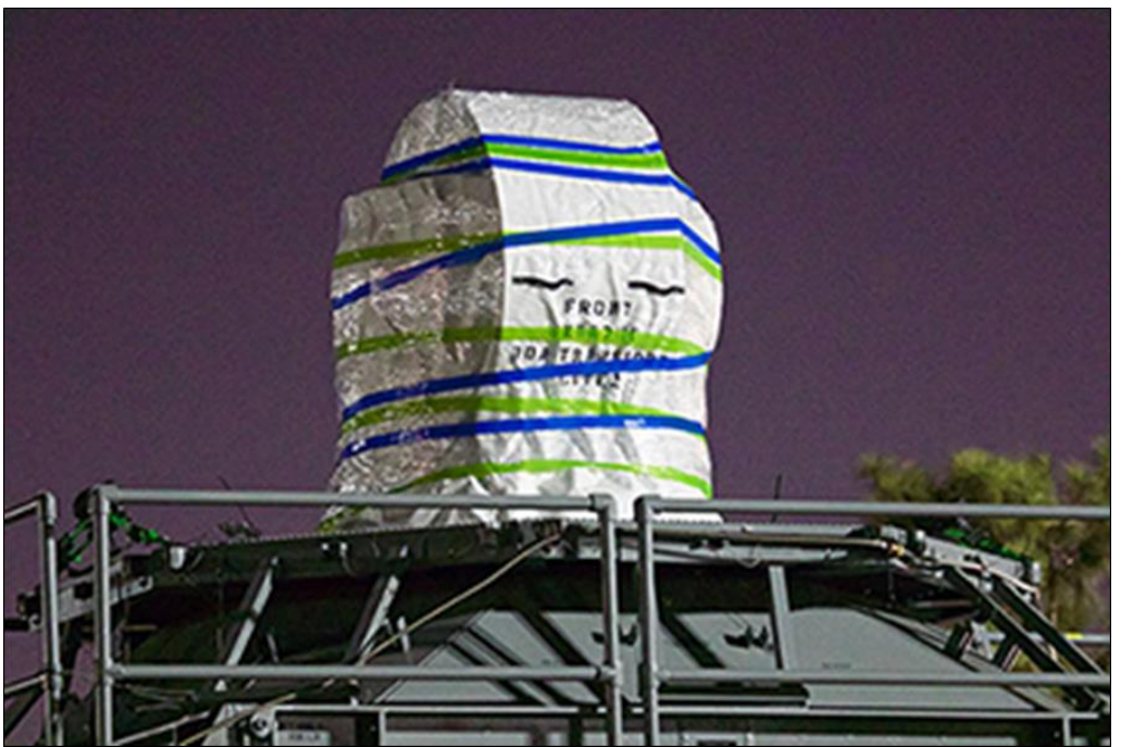
Figure 8. Reported SSL-TM Laser Being Transported

Source: Photograph accompanying Tyler Rogoway, "Mysterious Object Northrop Is Barging From Redondo Beach Is A High-Power Naval Laser," The Drive , October 18, 2019. The photograph is credited to "KABC CH7 Screencap."