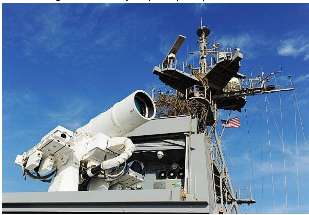
Figure I. Laser Weapon System (LaWS) on USS Ponce