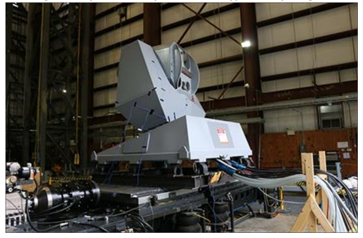
Figure 10. Reported ODIN System at Naval Support Facility Dahlgren

operability of ODIN, and manpower to conduct modeling & simulation of ODIN engagements. ^{\rm 23}