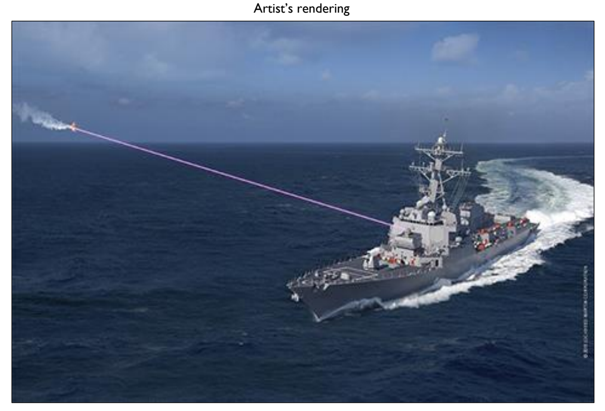
Figure 11. HELIOS System on DDG-51 Destroyer

SNLWS Increment 1 is called HELIOS, an acronym meaning high energy laser with integrated optical dazzler and surveillance. The HELIOS effort is focused on rapid development and rapid fielding of a 60 kW-class high-energy laser (with growth potential to 150 kW) and dazzler in an integrated weapon system, for use in countering UAVs, small boats, and ISR sensors, and for combat identification and battle damage assessment. In August 2022, it was reported that the first HELIOS system had been delivered to the Navy.<sup>27</sup> The system was installed on USS Preble (DDG-88).<sup>28</sup> Figure 11 and Figure 12 show renderings of HELIOS installed on a DDG-51.