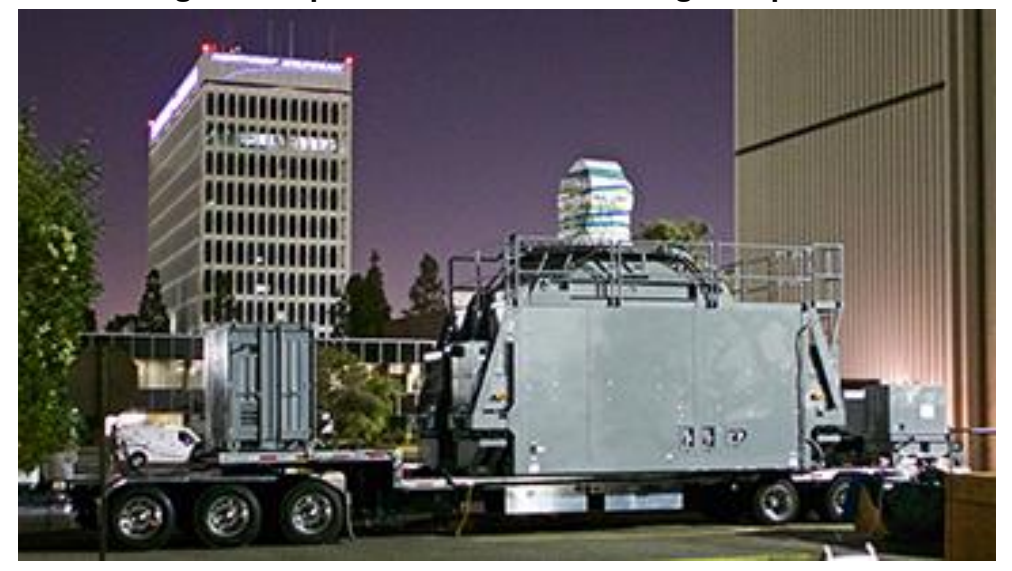
Figure 6. Reported SSL-TM Laser Being Transported