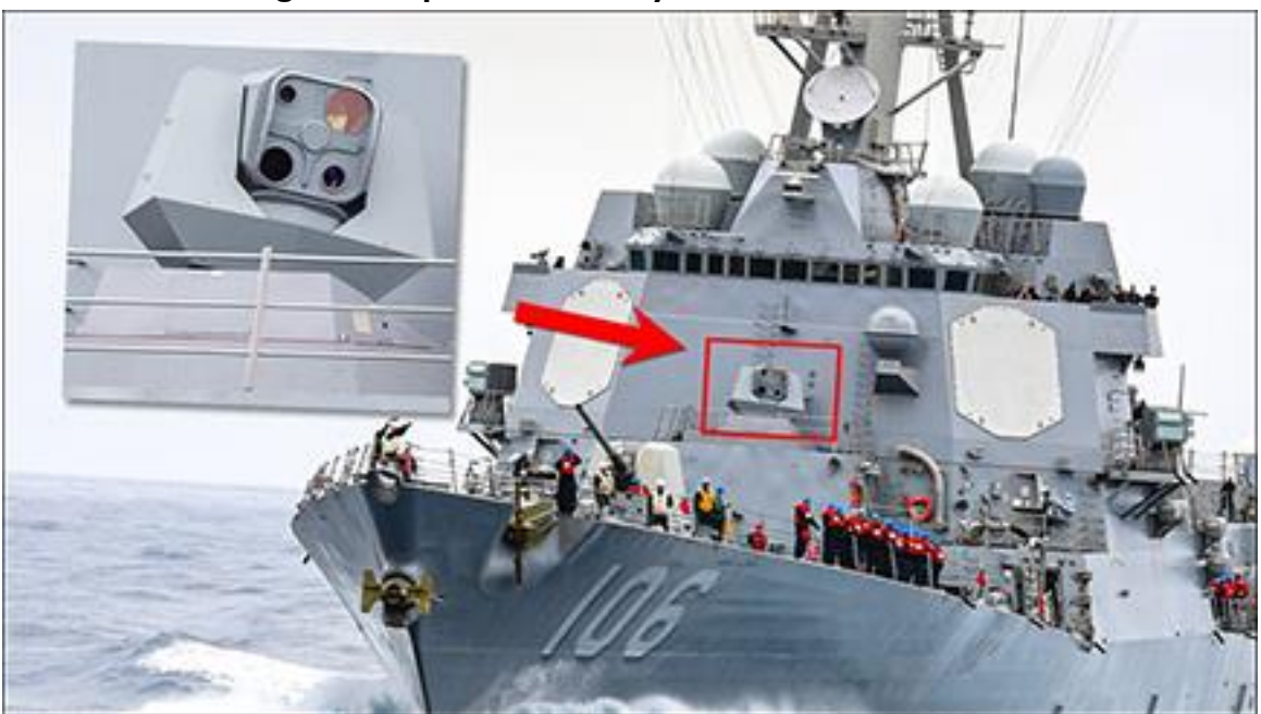
Figure 9. Reported ODIN System on USS Stockdale

Optical Dazzler Interdictor Navy (ODIN) systems are being installed on eight Arleigh Burke (DDG-51) class destroyers. Figure 9 and Figure 10 reportedly show an ODIN system. The first ODIN installation reportedly was done on the destroyer Dewey (DDG-105) in 2019.<sup>22</sup>