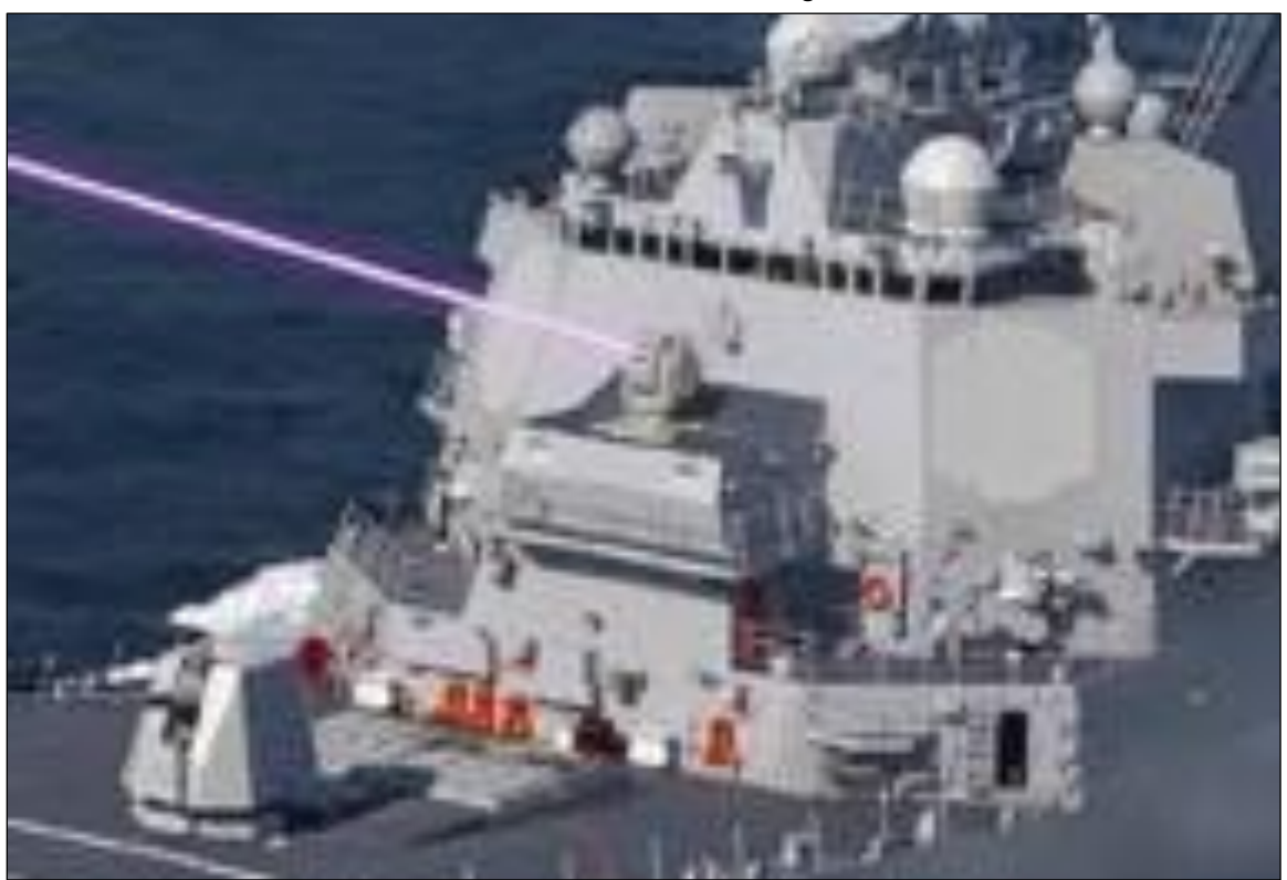
Figure 12. HELIOS System on DDG-51 Destroyer