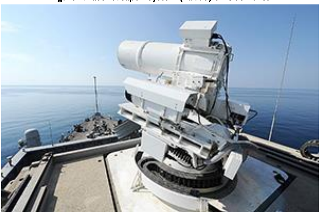
Figure 2. Laser Weapon System (LaWS) on USS Ponce