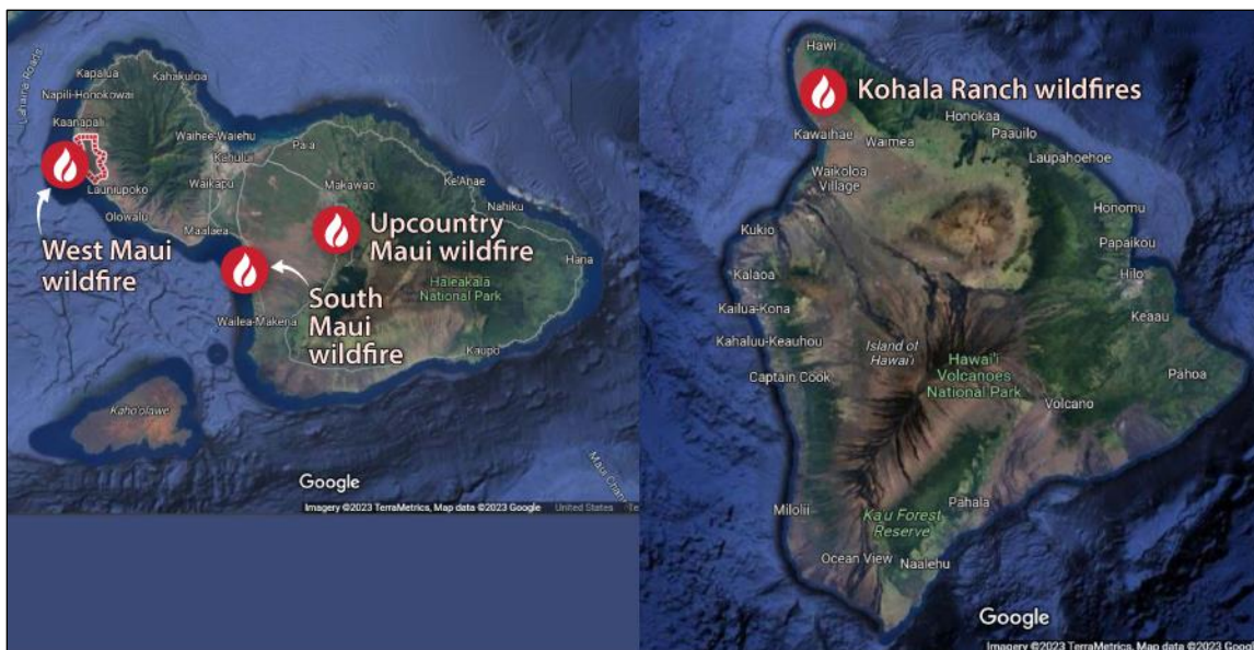
Figure 1. Maui and Hawaii Wildfires