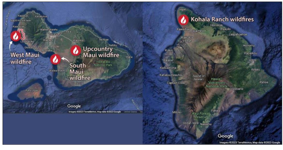
Figure I. Maui and Hawaii Wildfires