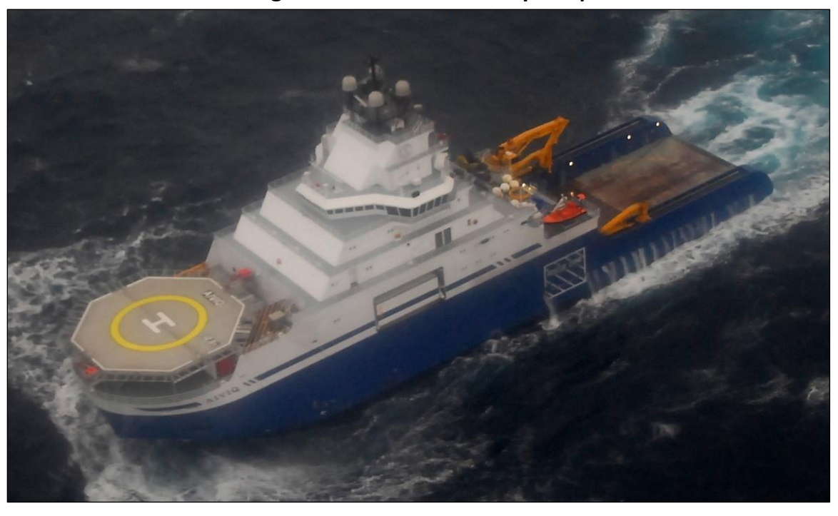
Figure A-8. Commercial Ship Aiviq