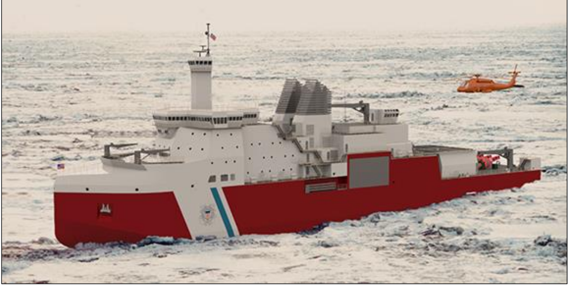
Figure 4. Rendering of Halter Marine Design for PSC