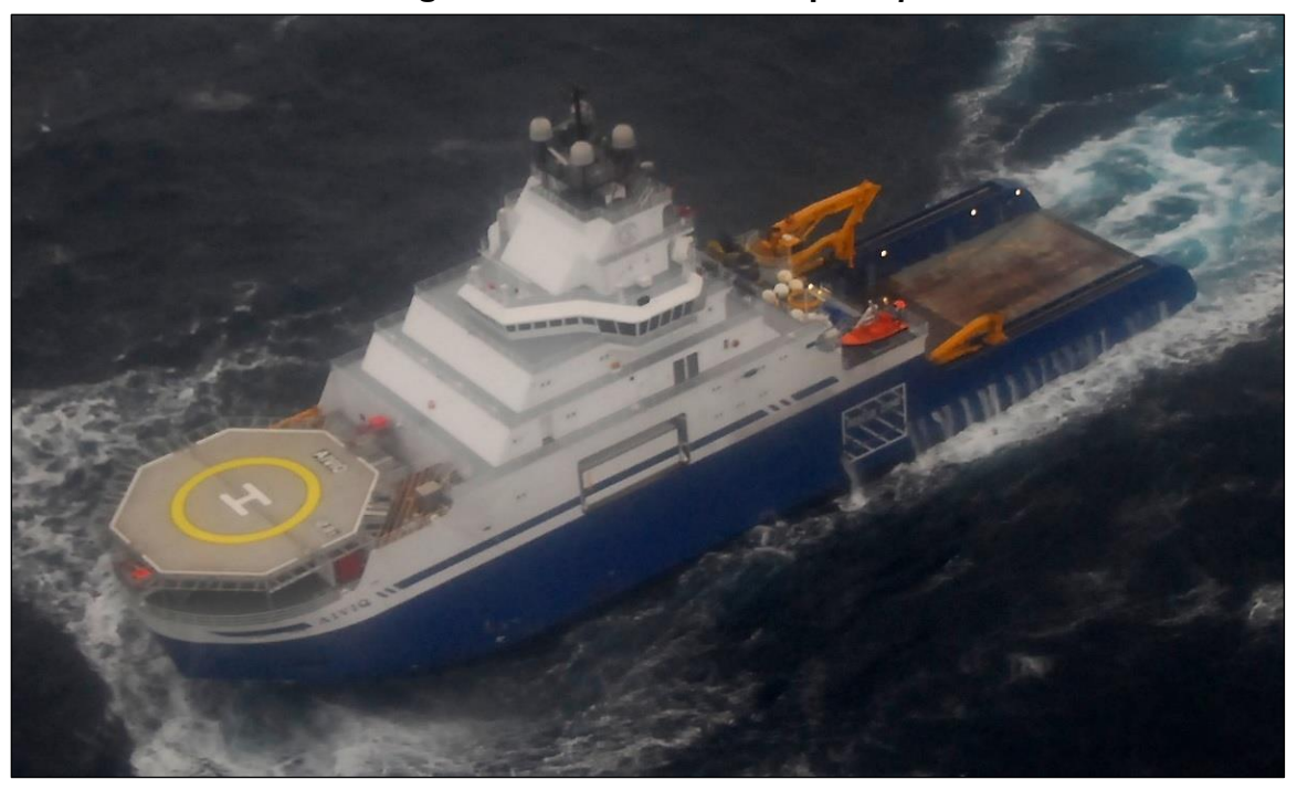
Figure A-8. Commercial Ship Aiviq