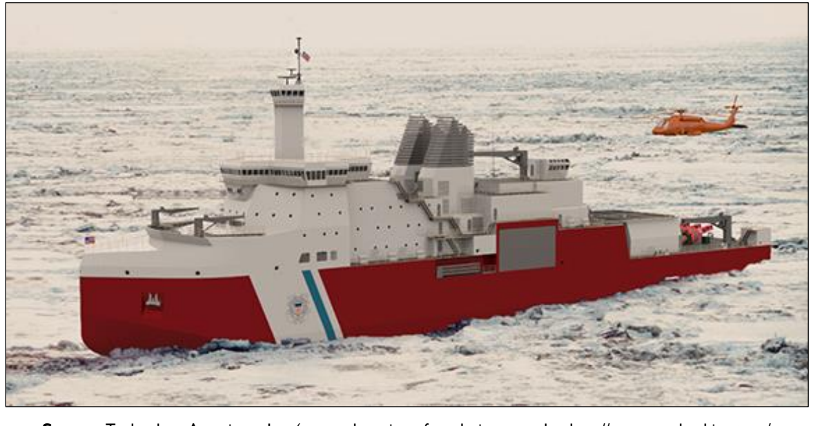
Figure 4. Rendering of Halter Marine Design for PSC