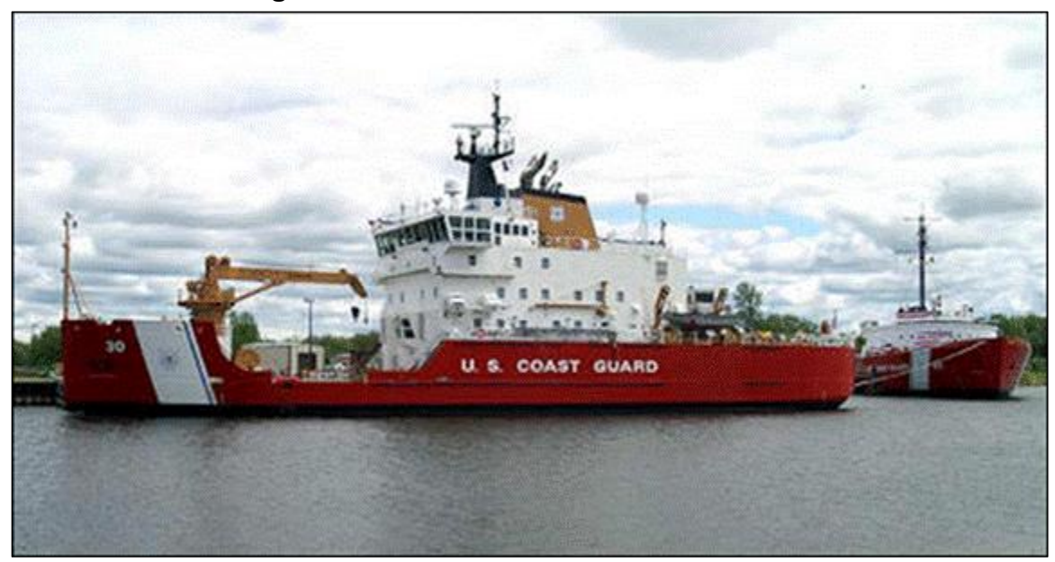
Figure C-I. Great Lakes Icebreaker Mackinaw

Source: U.S. Coast Guard, "USCGC Mackinaw," accessed September 11, 2019, at https://www.atlanticarea.uscg.mil/Our-Organization/District-9/Ninth-District-Staff/Prevention-Division/Cutters/MACKINAW/.