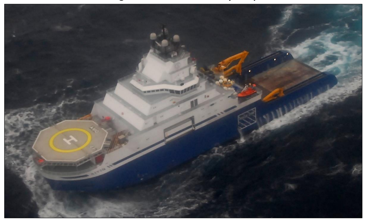
Figure A-8. Commercial Ship Aiviq