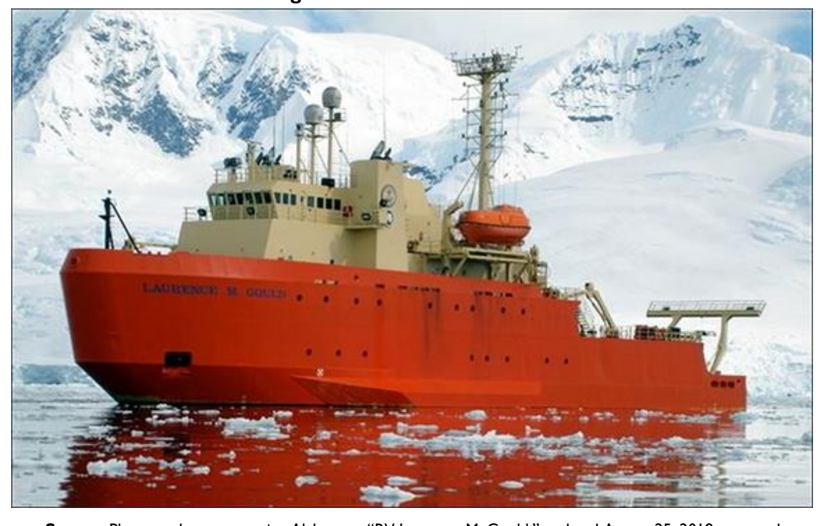
Figure A-5. Laurence M. Gould

Like Palmer , the polar research and supply ship Laurence M. Gould ( Figure A-5 ) was built for NSF by North American Shipping. It was completed in 1997 and is operated for NSF on a long-term charter from ECO. It is 230 feet long and has a displacement of about 3,800 tons. It has a crew of 16 and can embark a scientific staff of 26 to 28 (with a capacity for 9 more in a berthing van). It can break ice up to 1 foot thick with continuous forward motion. Like Palmer , it was built to support NSF operations in the Antarctic, particularly operations at Palmer Station on the Antarctic Peninsula.