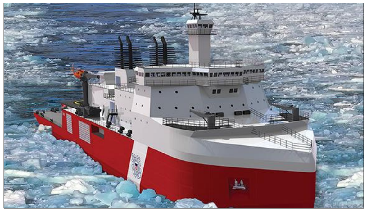
Figure 5. Rendering of Halter Marine Design for PSC