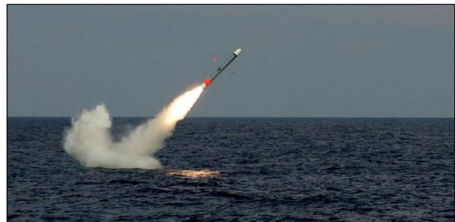
Figure 2. Tomahawk Cruise Missile