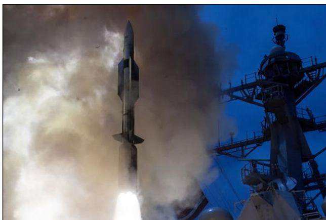
Figure 1. SM-6 Missile