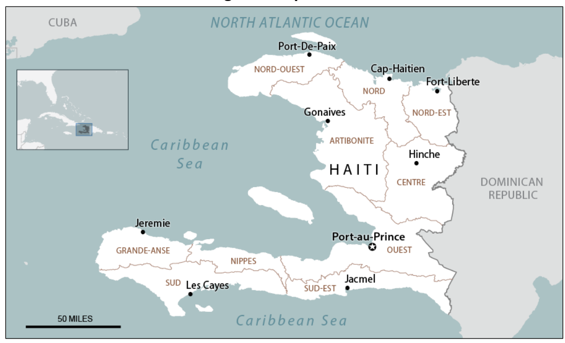
Figure I. Map of Haiti