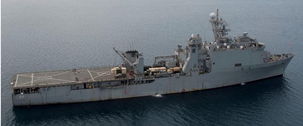
Figure I. LSD-41/49 Class Ship