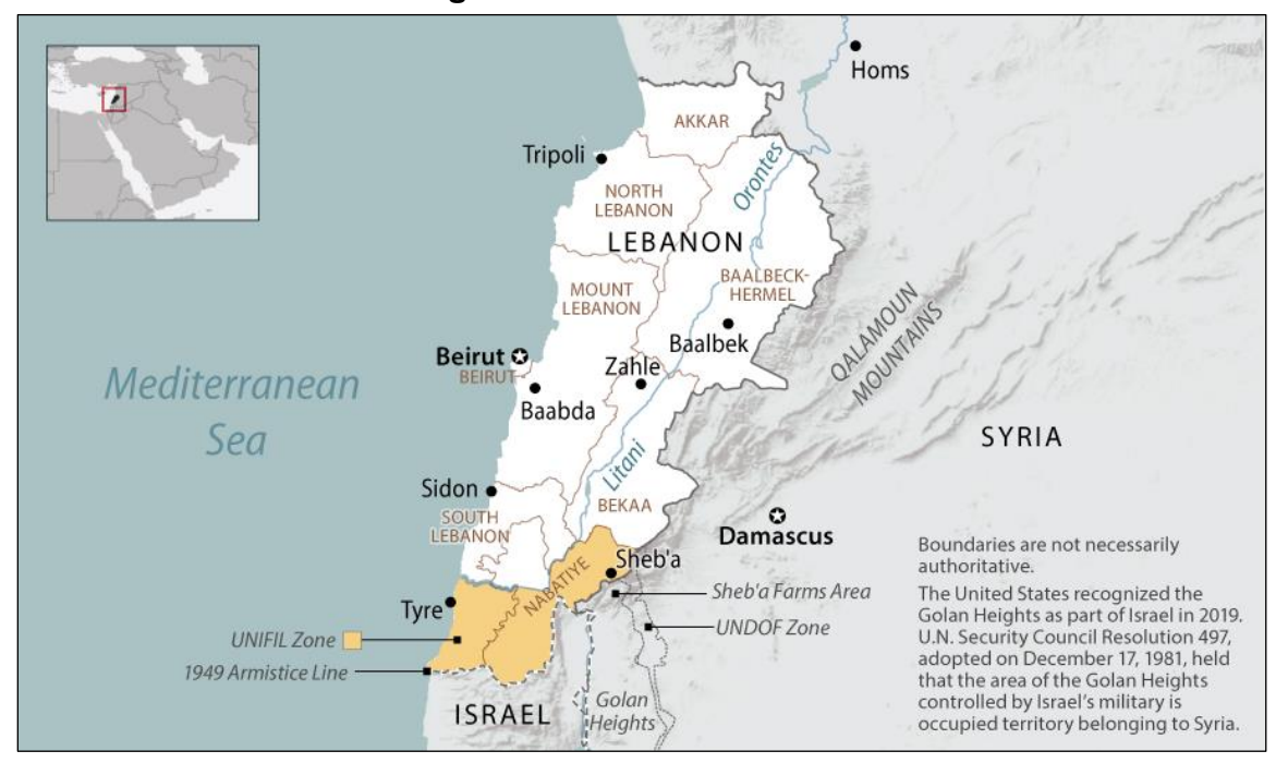
Figure 1. Lebanon at a Glance

Prior to World War I, the territories comprising modern-day Lebanon were governed as separate administrative regions of the Ottoman Empire. After the war, Britain and France divided the Ottoman Empire's Arab provinces into zones of influence under the terms of the 1916 Sykes Picot agreement. The area constituting modern-day Lebanon was granted to France, and in 1920, French authorities announced the creation of the state of Greater Lebanon. To form this new entity, French authorities combined the Maronite Christian enclave of Mount Lebanon—semiautonomous under Ottoman rule—with the coastal cities of Beirut, Tripoli, Sidon, and Tyre and their surrounding districts. These latter districts were (with the exception of Beirut) primarily Muslim and had been part of the Ottoman vilayet (province) of Syria.