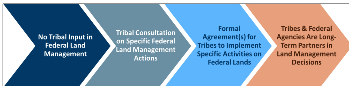
Figure 2. Federal-Tribal Co-management Spectrum