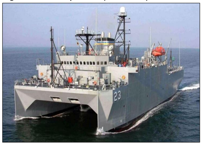
Figure 1. USNS Impeccable (TAGOS-23)