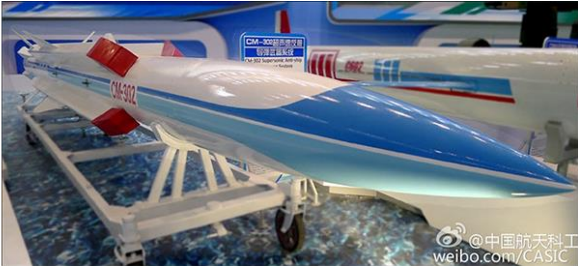
Figure 3. Reported Image of Anti-Ship Cruise Missile (ASCM)

Source: Detail of photograph accompanying Pierre Delrieu, "China Promotes Export of CM-302 Supersonic ASCM," Asian Military Review , July 3, 2017. (The article states "This is an article published in our December 2016 Issue.") The article states "According to Chinese news media reports, the China Aerospace Science and Industry Corporation (CASIC) CM-302 missile is being marketed for export as "the world's best anti-ship missile." The missile was showcased at the Zhuhai air show in the southern People's Republic of China (PRC) in early November [2016], and is advertised as [a] supersonic Anti-Ship Missile (AShM) [ASCM] which can also be used in the land attack role. The report, published by the national newspaper China Daily , suggest[s] that the CM-302 is the export version of CASIC's YJ-12 supersonic AShM, which is in service with the PRC's armed forces.")