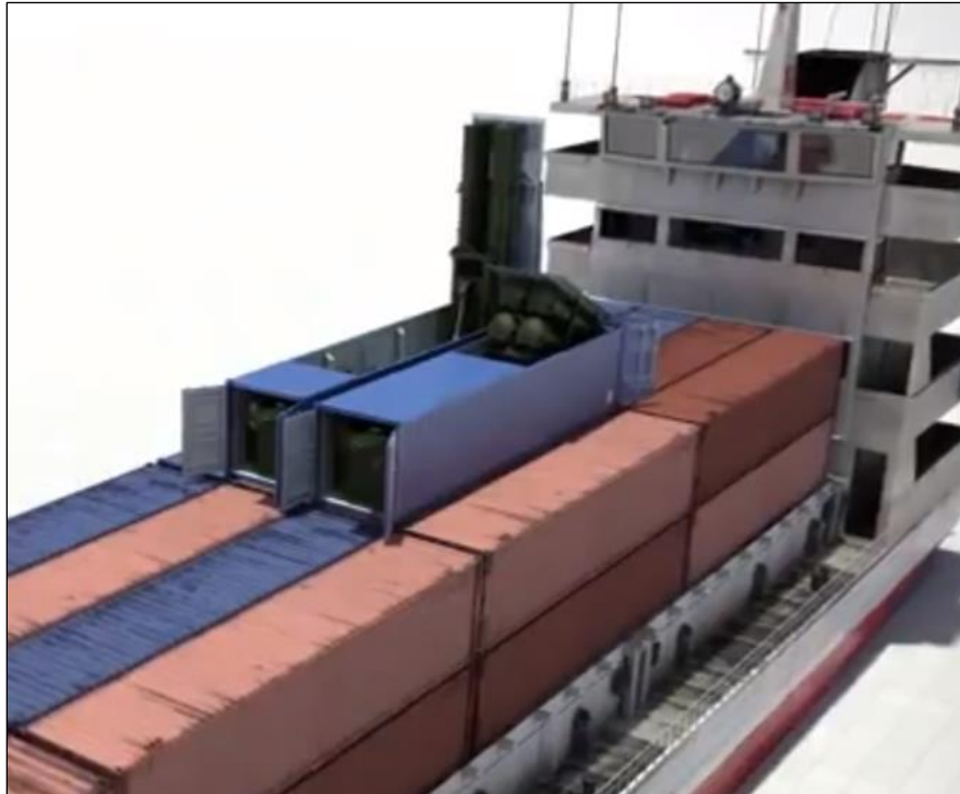
Figure 6. Illustration of Reported Potential Containerized ASCM Launcher

Source: Illustration accompanying Tariq Tahir, "China Feared to be Hiding Missiles in Shipping Containers for Trojan Horse-Style Plan to Launch Attack Anywhere in World," U.S. Sun , December 6, 2021.