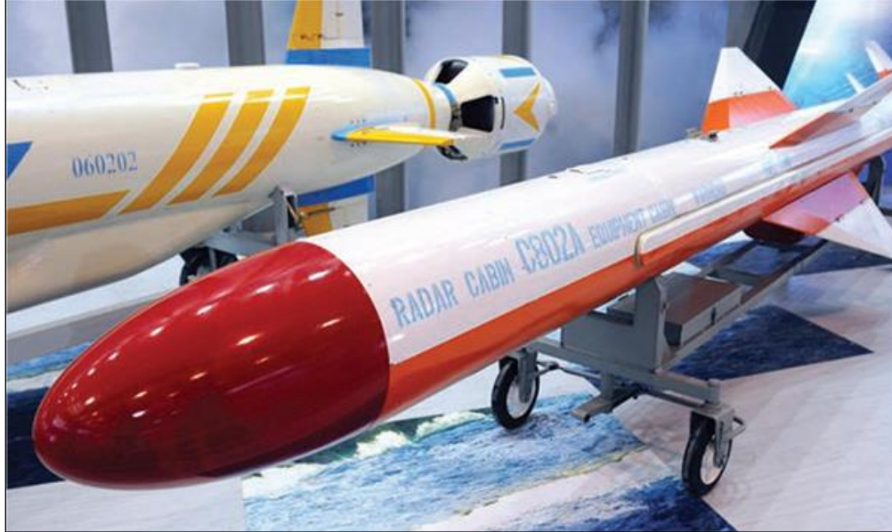
Figure 5. Reported Image of Anti-Ship Cruise Missile (ASCM)