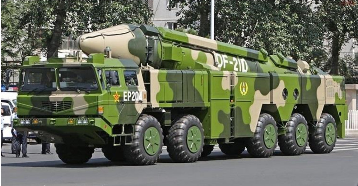
Figure 1. DF-21D Anti-Ship Ballistic Missile (ASBM)