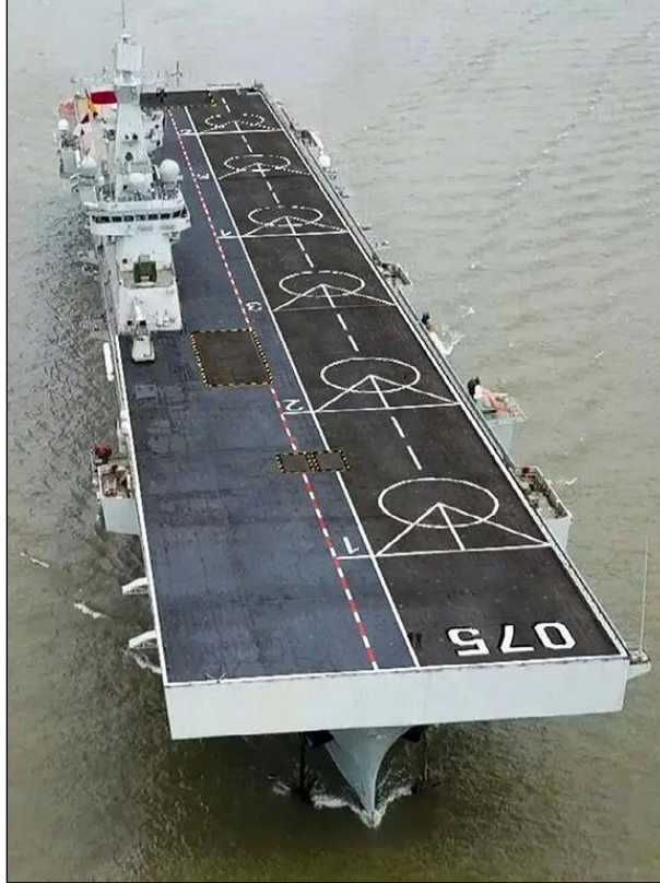
Figure 25. Type 075 Amphibious Assault Ship

Source: Photograph accompanying Liu Zhen, "Chinese Military's First Type 075 Amphibious Assault Ship Begins Sea Trial," South China Morning Post , August 7, 2020. The article credits the photograph to Weibo. Possible Type 076 Catapult-Equipped Amphibious Assault Ship.