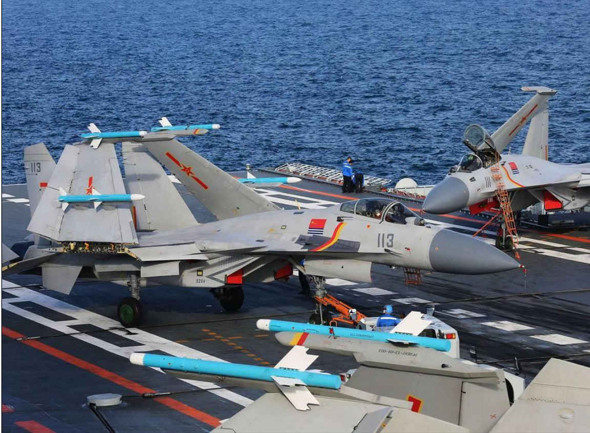
Figure 16. J-15 Flying Shark Carrier-Capable Fighter