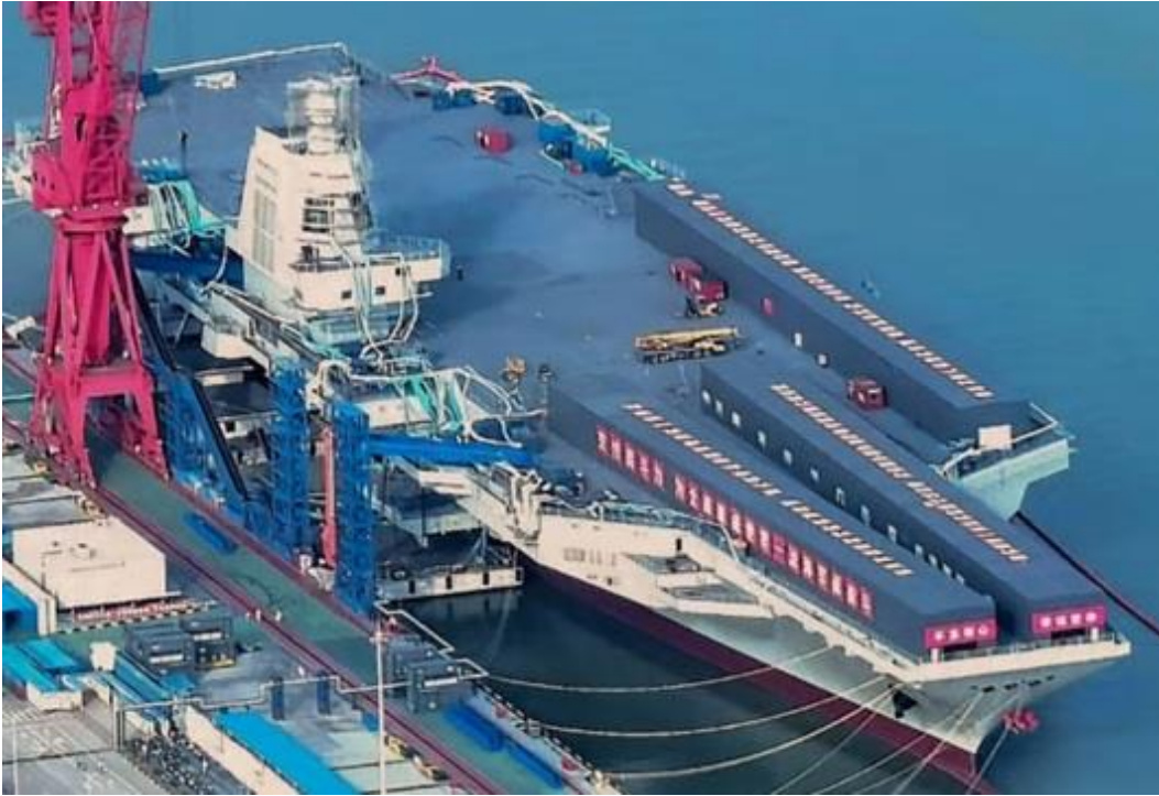
Figure 13. Fujian (Type 003) Aircraft Carrier