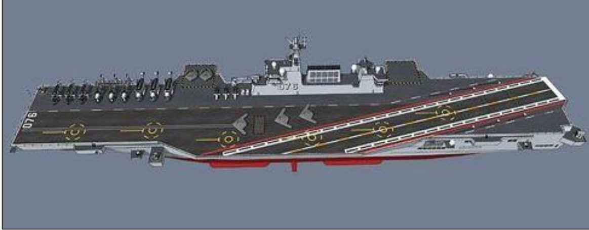
Figure 27. Notional Rendering of Possible Type 076 Amphibious Assault Ship