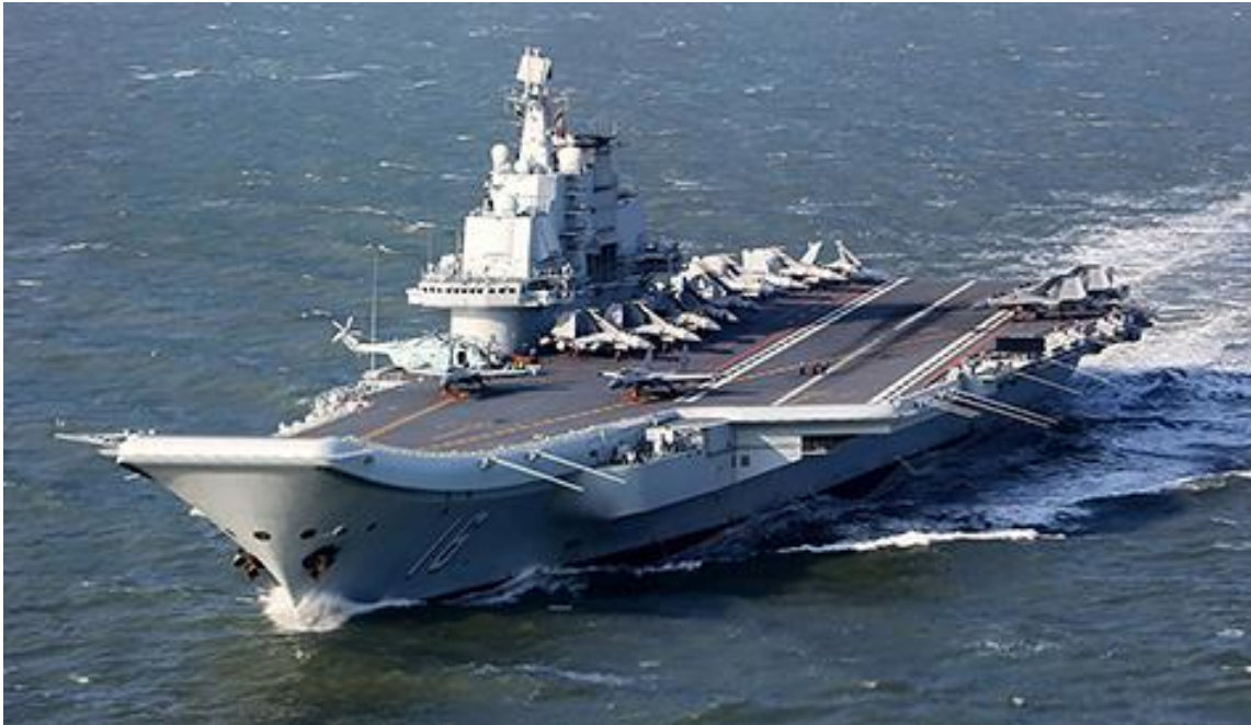
Figure 10. Liaoning (Type 001) Aircraft Carrier