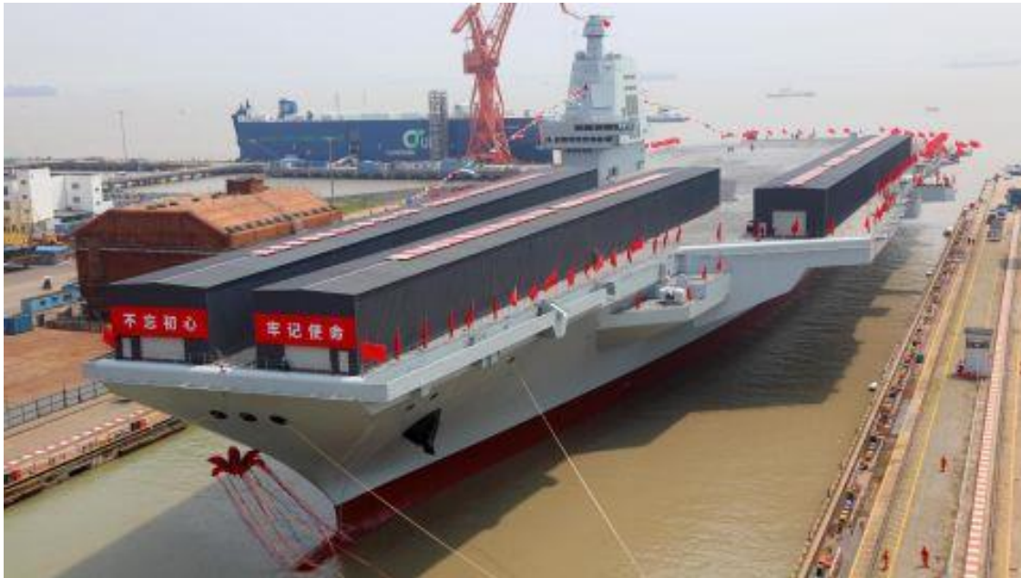
Figure 12. Fujian (Type 003) Aircraft Carrier