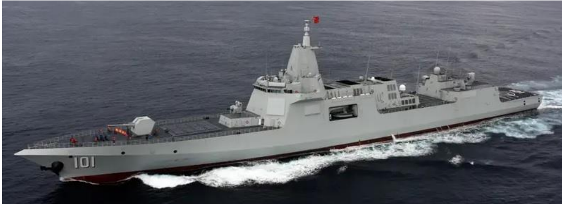
Figure 17. Renhai (Type 055) Cruiser (or Large Destroyer)

Source: Cropped version of photograph accompanying Marielle Descalsota, “Take a Look at China’s Biggest Destroyer, a $920 Million Cruiser That’s Said to Be the 2 nd Most Powerful in the World after the USS Zumwalt,” Business Insider , June 22, 2022. The photograph is credited to Sun Zifa/China News Service/Getty Images.