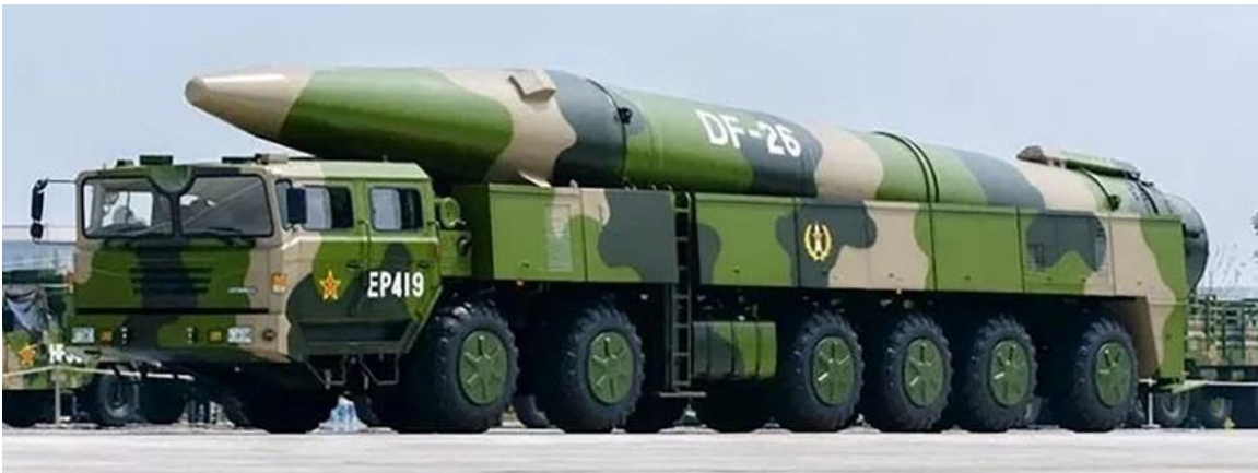
Figure 2. DF-26 Multi-Role Intermediate-Range Ballistic Missile (IRBM)