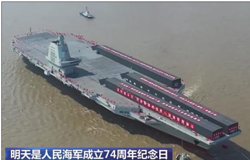
Figure 14. Fujian (Type 003) Aircraft Carrier