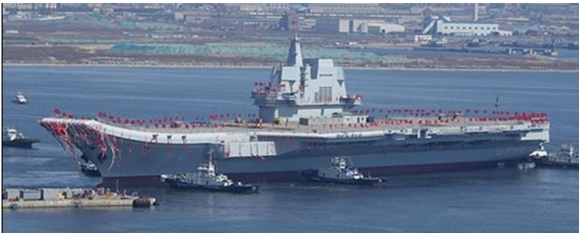
Figure 11. Shandong (Type 002) Aircraft Carrier