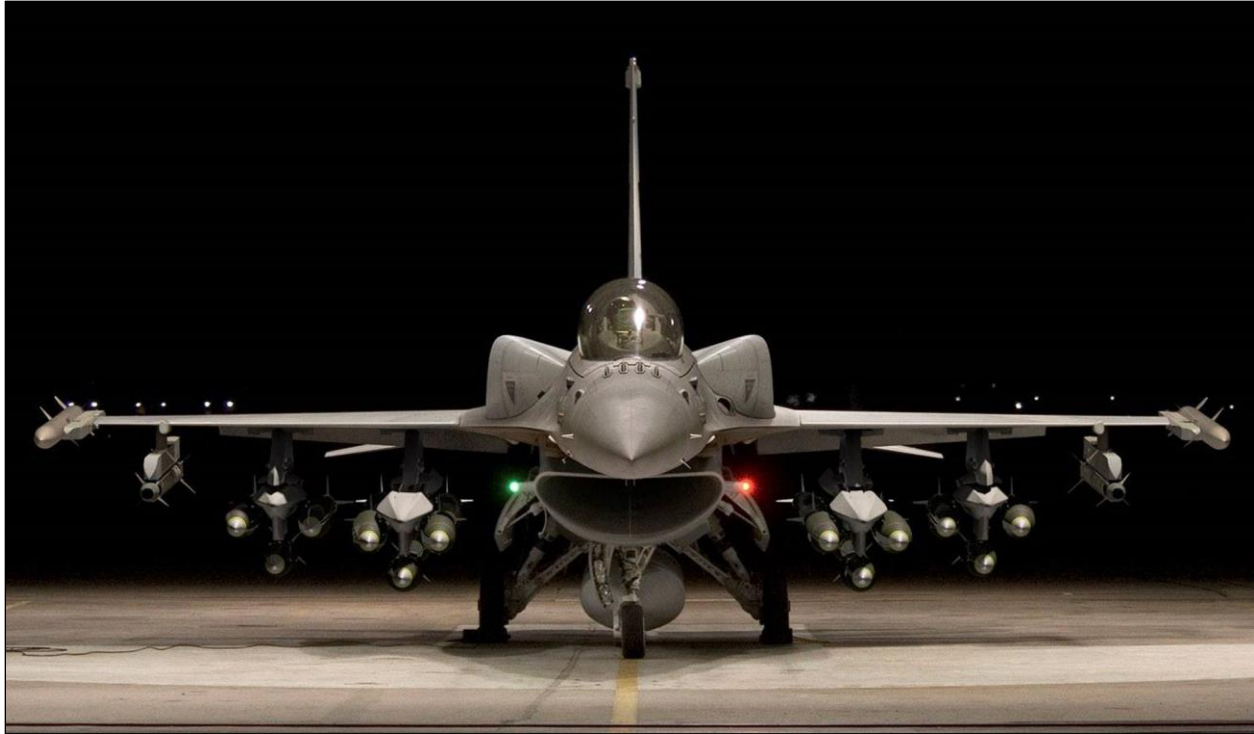
Figure 1. F-16 Block 70/72 Viper Configuration