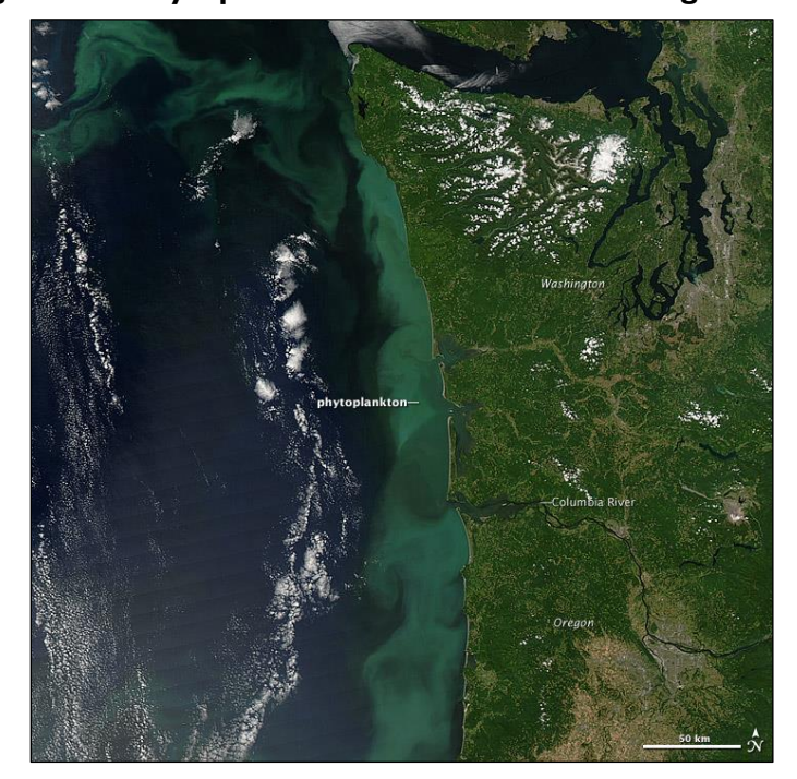
Figure A-I. Phytoplankton Bloom off the Washington Coast

Chlorophyll concentrations provide information about ocean health and primary productivity in surface waters. Deep, cold waters tend be nutrient-rich; when these waters are exposed to sunlight, marine phytoplankton absorb solar energy and atmospheric CO<sub>2</sub> to form organic matter, forming the base of the marine food chain for larger organisms to feed on them. Phytoplankton are composed of organic (flesh) and inorganic (shell) carbon; thus, when phytoplankton die, the inorganic shell of the organism sinks to depth in the ocean, removing carbon from the surface waters. This process provides a natural atmospheric CO<sub>2</sub> sink.