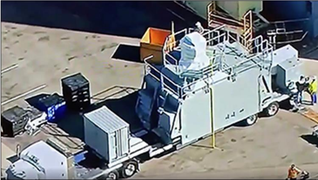
Figure 7. Reported SSL-TM Laser Being Transported