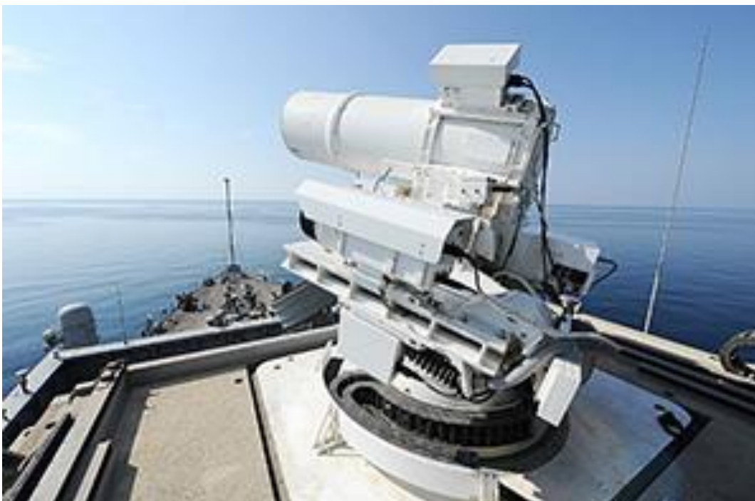
Figure 2. Laser Weapon System (LaWS) on USS Ponce