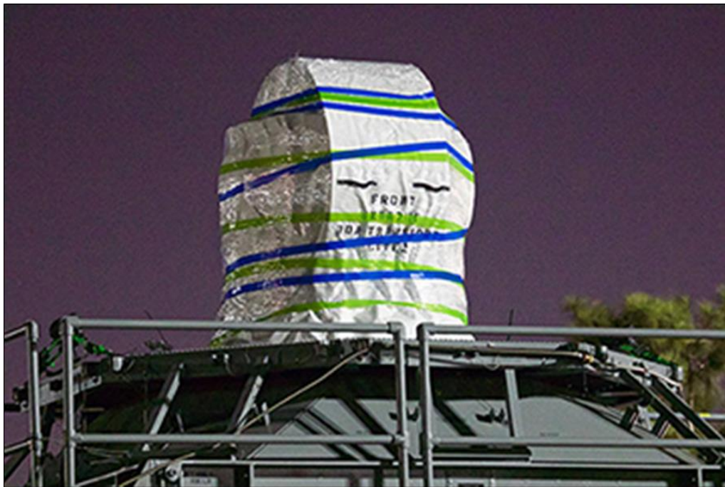
Figure 8. Reported SSL-TM Laser Being Transported