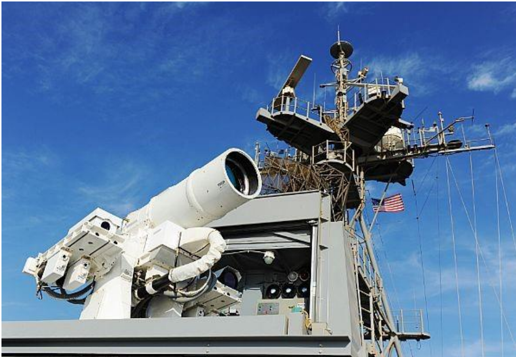
Figure 1. Laser Weapon System (LaWS) on USS Ponce