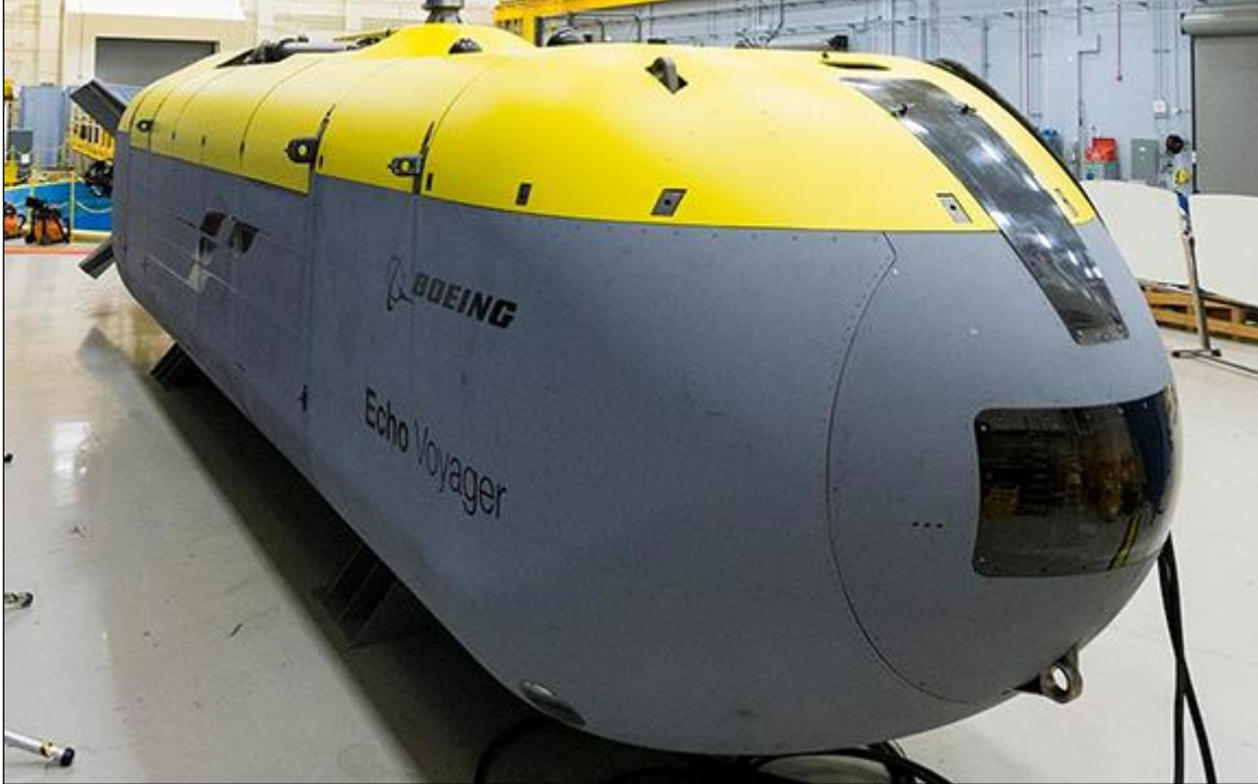
Figure 7. Boeing Echo Voyager UUV