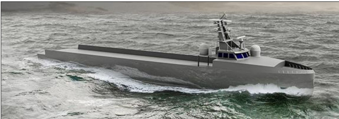
Figure 6. Rendering of L3Harris Design Concept for MUSV