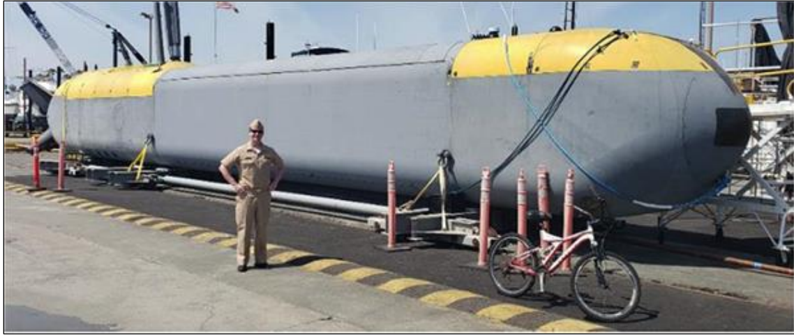
Figure 9. Boeing Echo Voyager UUV