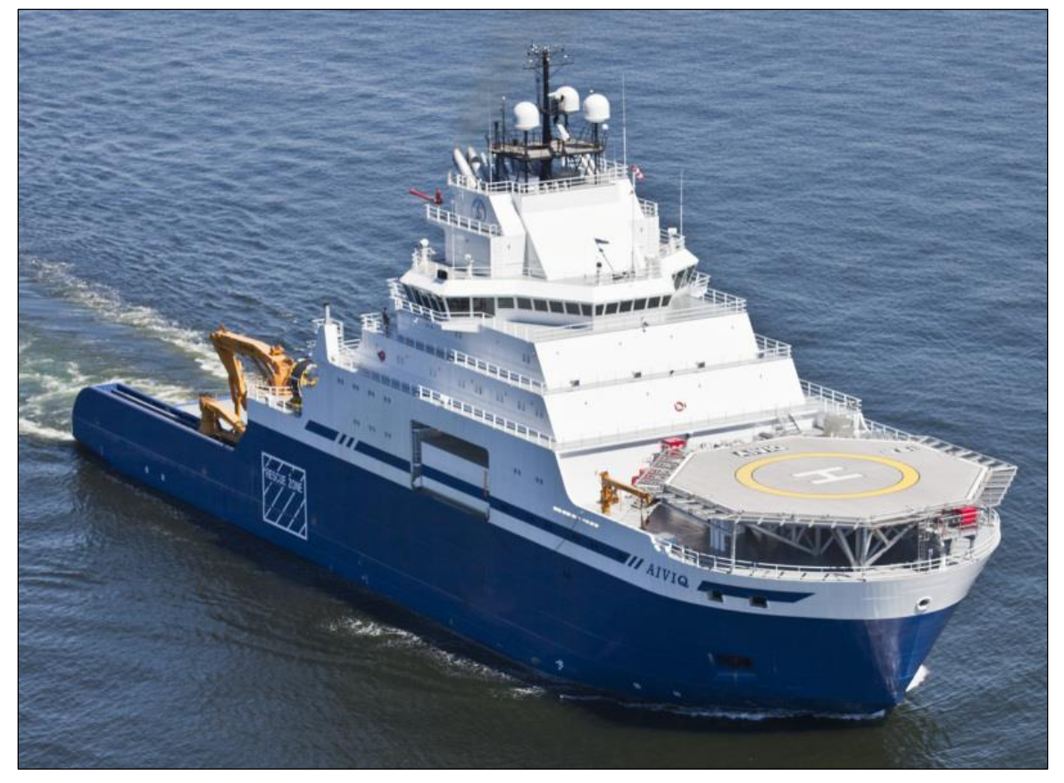
Figure A-7. Commercial Ship Aiviq

Mawson and assisting with resupply and changeover of expeditioner teams.... The Aiviq will form a large part of the 2022/23 shipping season, with RSV Nuyina's return from maintenance delayed due to a delay in receiving spare parts.<sup>73</sup> ( Nuyina is an Australian Antarctic icebreaker.)