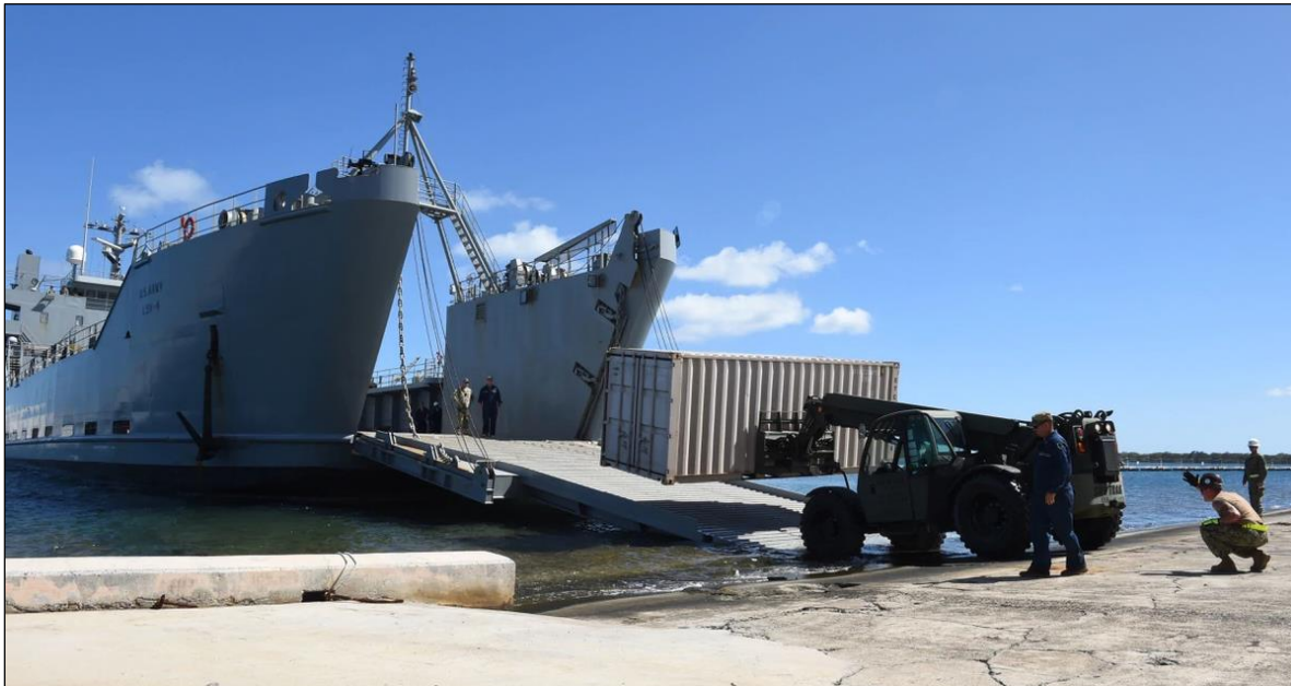
Figure 4. Besson-Class Logistics Support Vessel (LSV)

Source: Cropped version of photograph accompanying Walker D. Mills and Joseph Hanacek, "The US Navy and Marine Corps Should Acquire Army Watercraft," Defense News , June 22, 2020. The caption to the photograph credits the photograph to the U.S. Navy and states, "U.S. Navy sailors conduct a simulated disaster relief supply offload from a General Frank S. Besson-class logistics support vessel at Joint Base Pearl Harbor-Hickam on July 10, 2016."