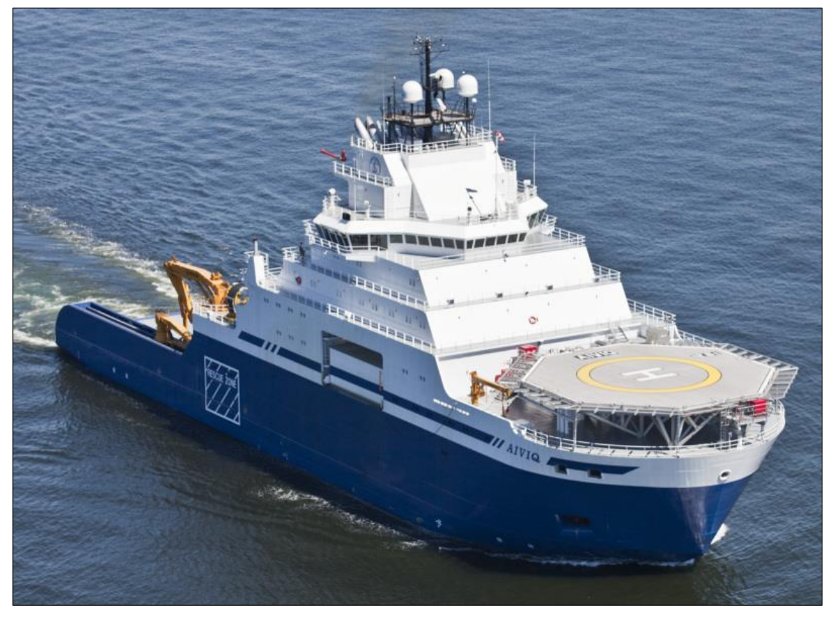
Figure A-7. Commercial Ship Aiviq

Mawson and assisting with resupply and changeover of expeditioner teams.... The Aiviq will form a large part of the 2022/23 shipping season, with RSV Nuyina 's return from maintenance delayed due to a delay in receiving spare parts.<sup>69</sup> ( Nuyina is an Australian Antarctic icebreaker.)