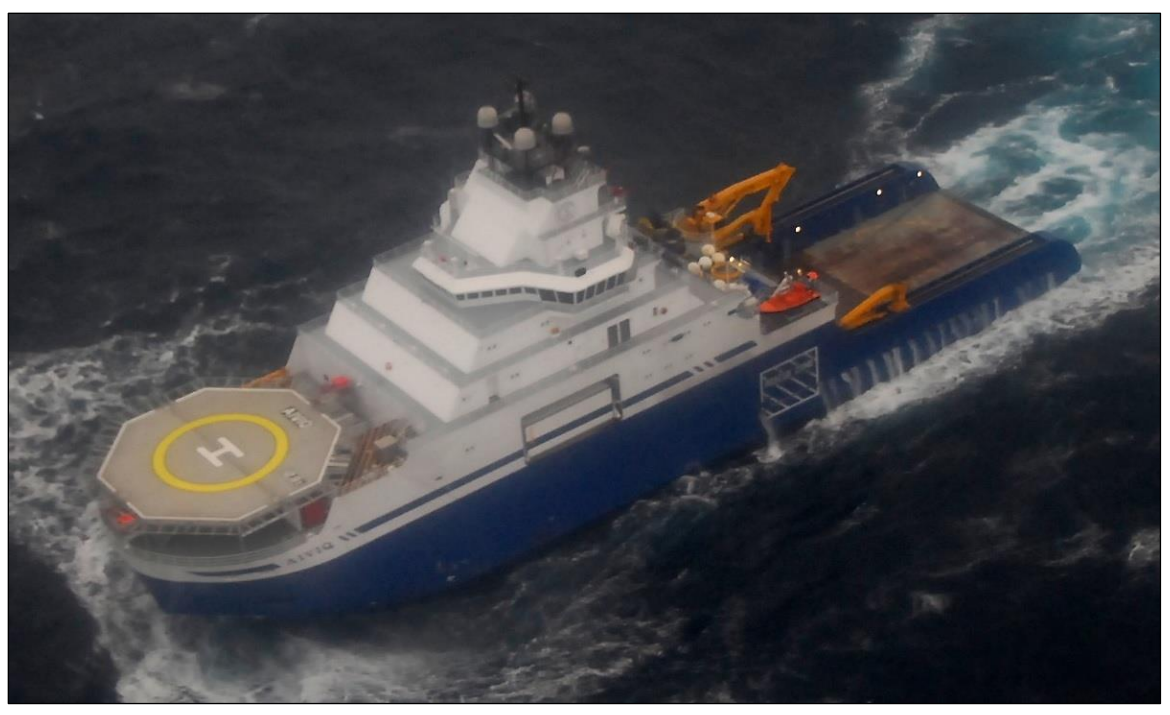
Figure A-8. Commercial Ship Aiviq