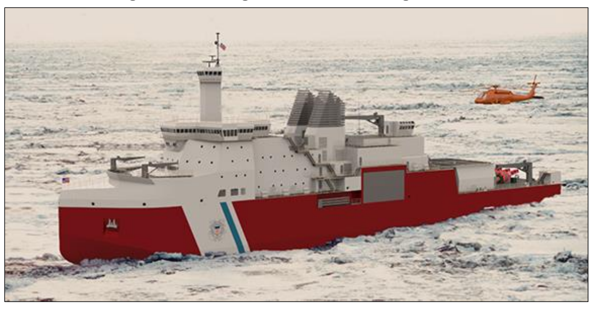
Figure 4. Rendering of Halter Marine Design for PSC

Source: Technology Associates, Inc. (cropped version of rendering posted at http://www.navalarchitects.us/pictures.html, accessed June 10, 2020). A similar image was included in Halter Marine press release, "VT Halter Marine Awarded the USCG Polar Security Cutter," May 7, 2019, accessed May 8, 2019, at http://www.vthm.com/public/files/20190507.pdf.