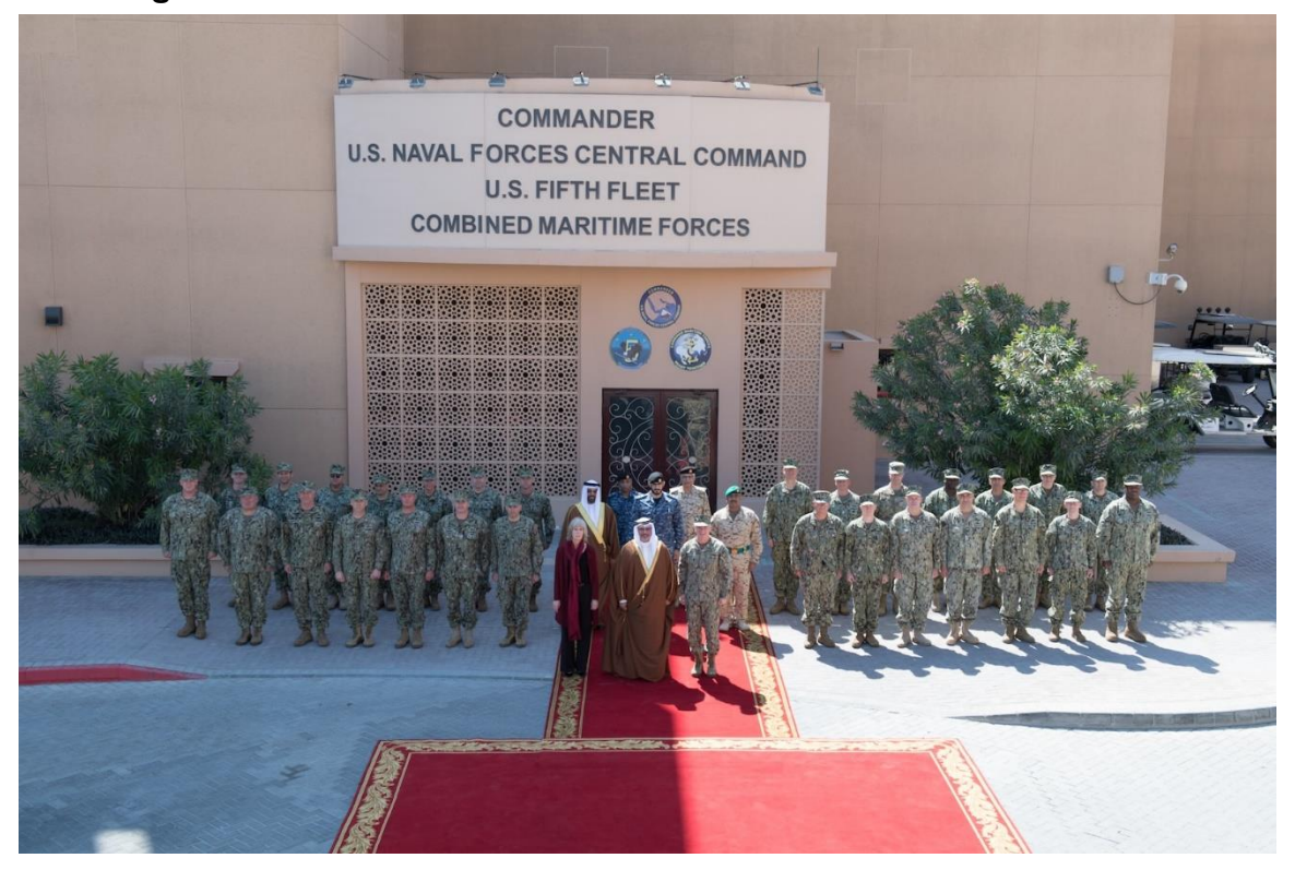
Figure 4. Crown Prince Salman bin Hamad Al Khalifa visits NAVCENT