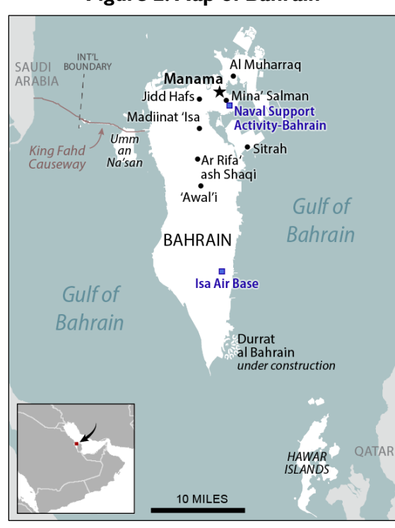
Figure 2. Map of Bahrain