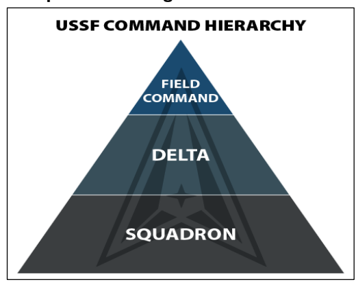
Figure 2. Space Force Organizational Structure