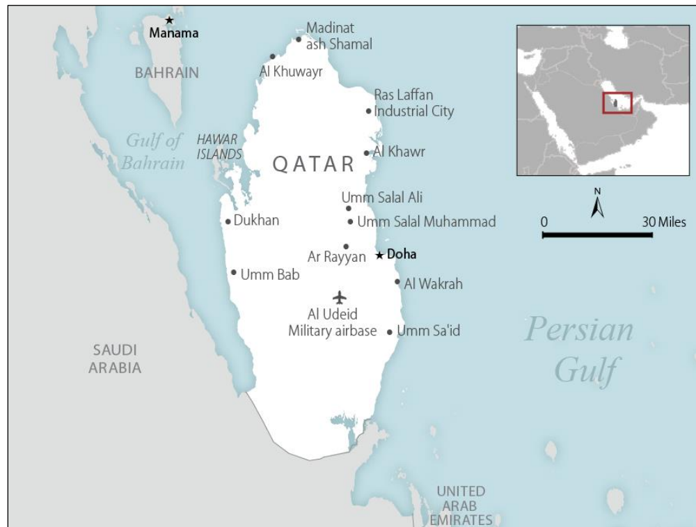
Figure 1. Qatar at-a-Glance

deepened since the mid-1990s, and in May 2022, CENTCOM commander General Erik Kurilla described U.S.-Qatar defense cooperation as “a critically important strategic partnership.” 4