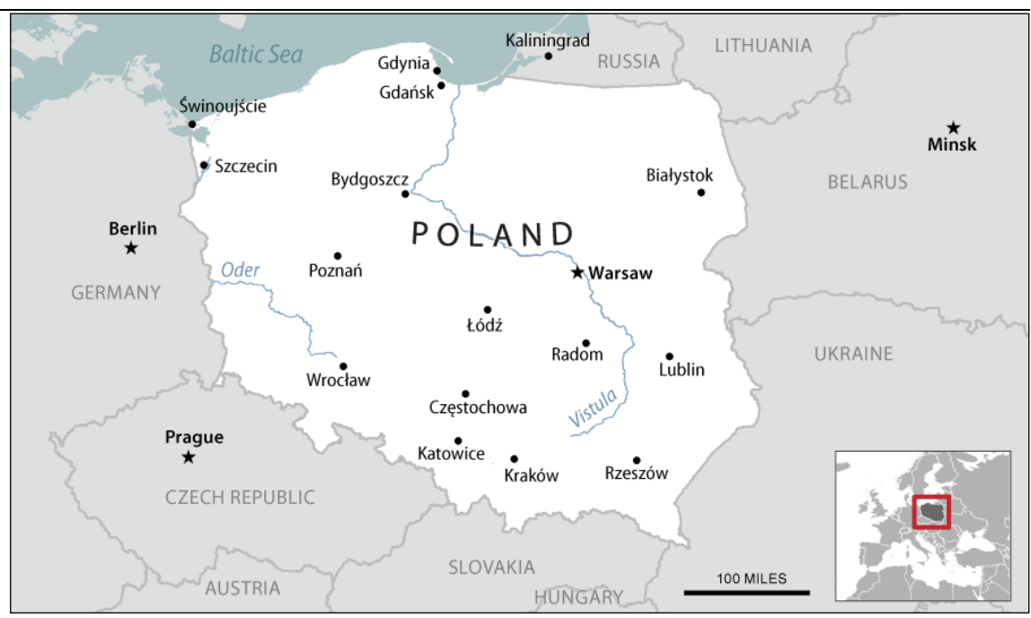
Figure 1. Poland: Map and Basic Facts

Many U.S. officials and Members of Congress consider Poland to be a strong ally of the United States and one of the most pro-U.S. countries in Europe. Of the Central European and Baltic countries that have joined the North Atlantic Treaty Organization (NATO) and the European Union (EU) since the end of the Cold War, Poland is the most populous, has the largest economy, and is the most significant actor in terms of security and defense issues. In 1999, with strong backing from the United States, Poland was among the first group of post-communist countries to join NATO. In 2004, again with strong support from the United States, it was among a group of post-communist countries to join the EU.