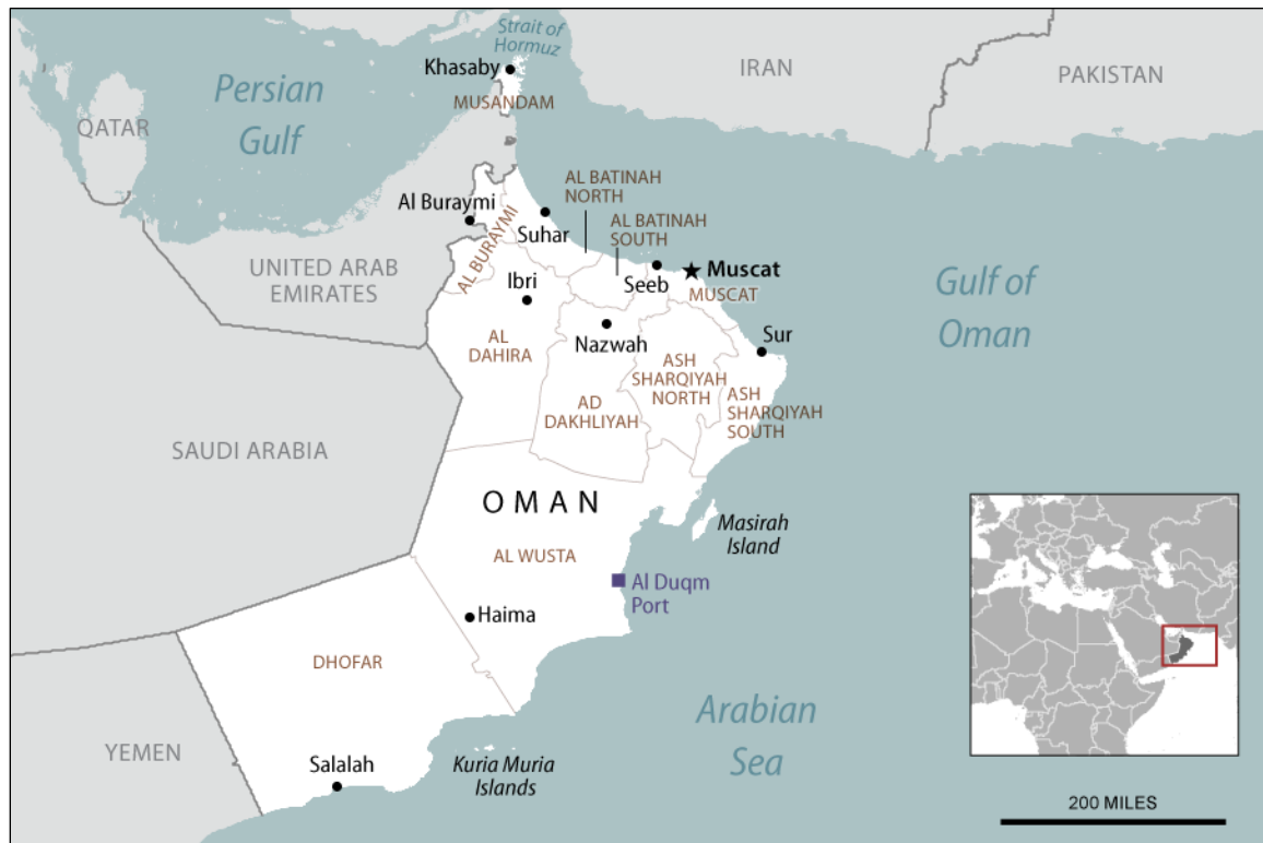
Figure 1. Oman

Product ratio is already the second highest in the GCC after Bahrain's (total debt is $104 billion). 5 In 2021, unemployed or underemployed youth protested in several Omani cities demanding access to stable jobs; Sultan Haythim had enacted austerity measures to rein in public spending. 6 In 2022, pressure on the treasury has somewhat eased due to higher oil prices and government repayment of sovereign debt, though the fundamental challenge of how Oman transitions to a post-oil, private-sector led economy remains. 7