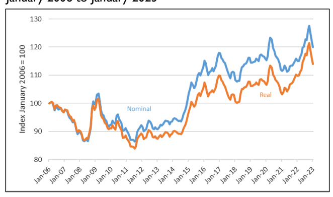
Figure 1. Broad Dollar Index January 2006 to January 2023