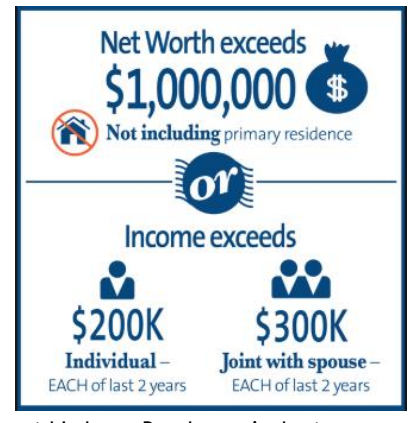
Figure 2. Who Is an Accredited Investor as Measured by Income and Net Worth?

Source: Financial Industry Regulatory Authority.