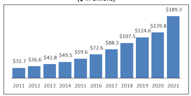
Figure 1. U.S. Digital Advertising Revenue ($ in billions)