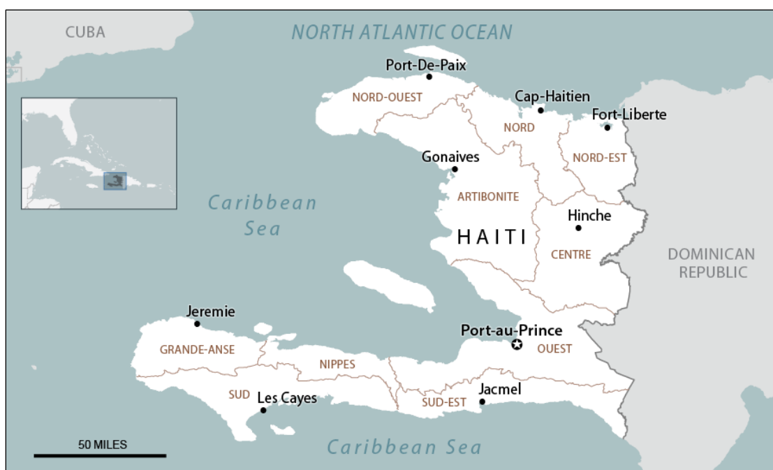
Figure I. Map of Haiti