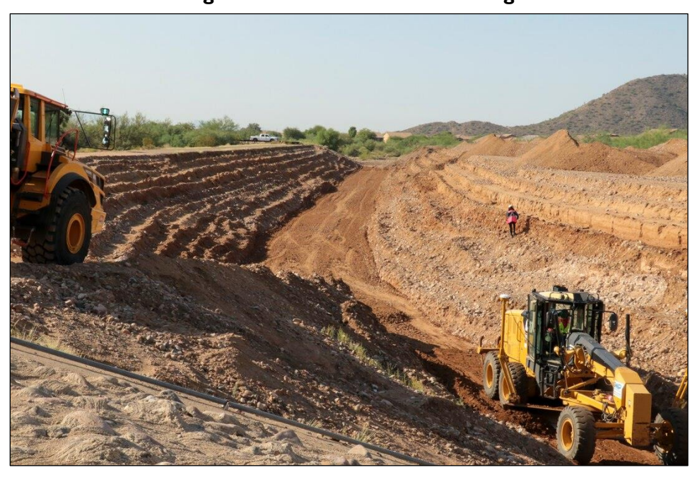
Figure 2. New River Dam Outlet Channel Repair Through P.L. 84-99 Rehabilitation Program

USACE's P.L. 84-99 Rehabilitation Program may provide assistance for nonfederally operated flood control works if a facility is damaged by qualifying floods, storms, or seismic activity. <sup>66</sup> The majority of the works in the P.L. 84-99 Rehabilitation Program are levees, but the program may provide federal support to repair damage for nonfederal dams that opt into the program and meet certain criteria (e.g., the reservoir behind the dam has storage capacity for a 200-year flood event, otherwise referred to as a flood event having 0.5% chance of occurring in any given year). <sup>67</sup> See Figure 2 for an example of these repairs. According to USACE, there are 124 dams active in the program. <sup>68</sup>