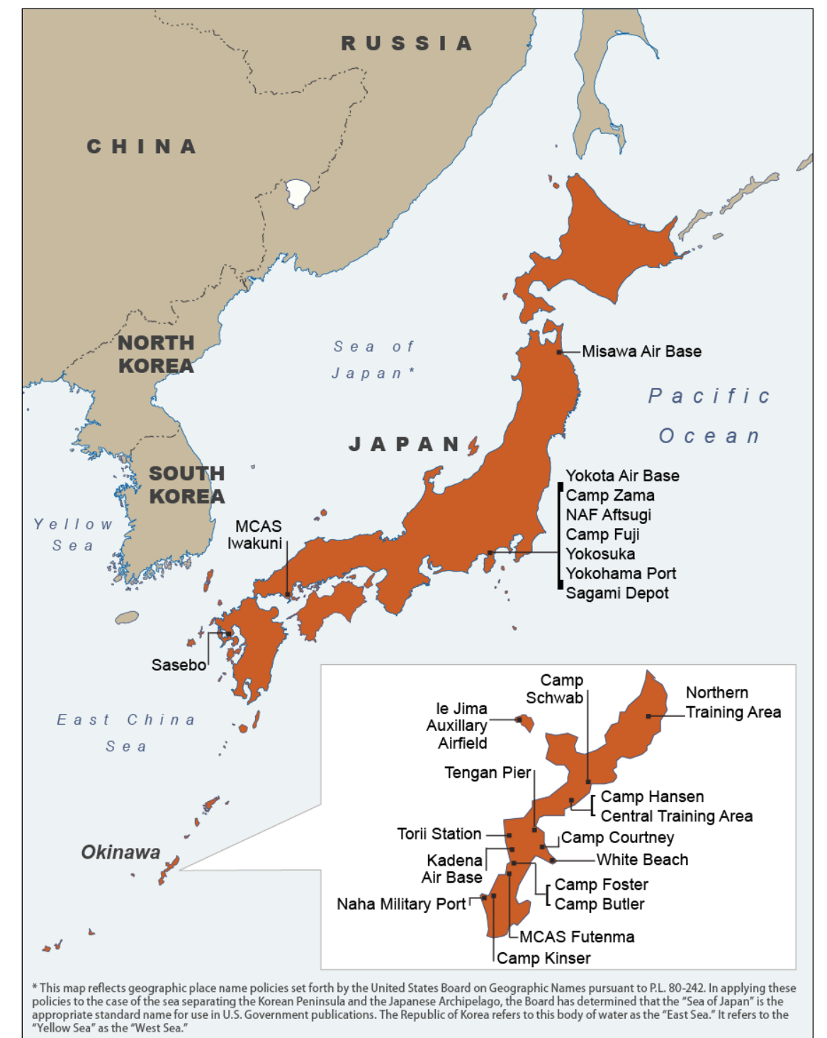
Figure 2. Map of Major U.S. Military Facilities in Japan