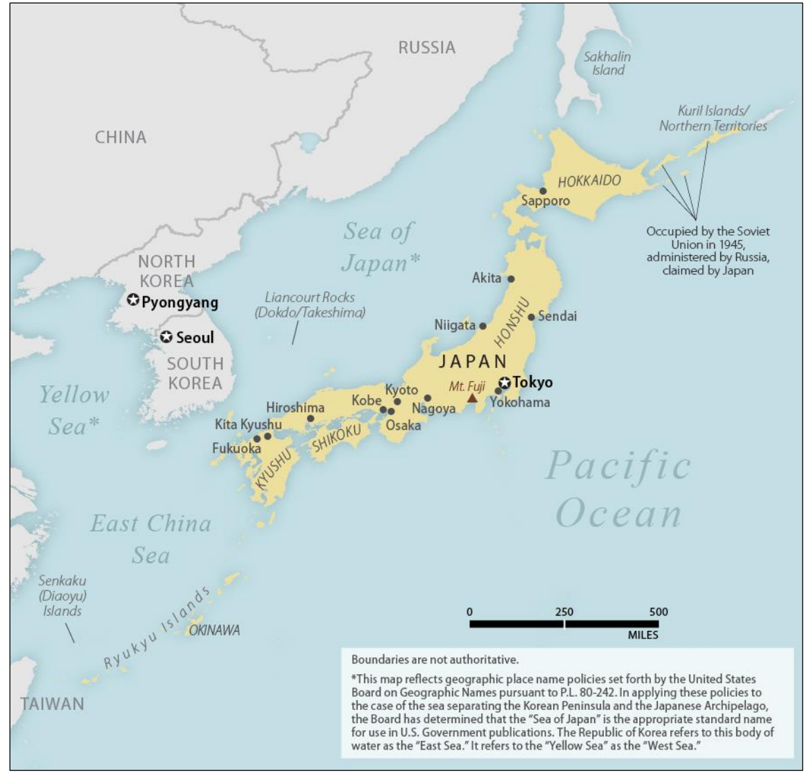
Figure 1. Map of Japan