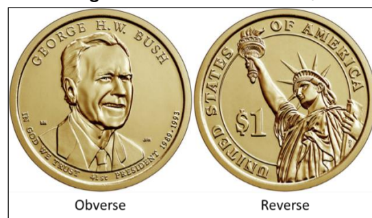
Figure 2. George H.W. Bush Presidential $1 Coin