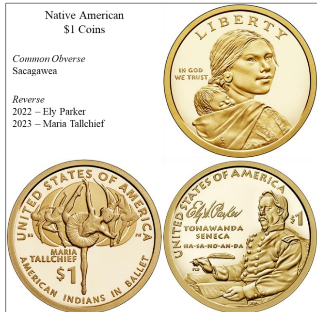
Figure 1. 2022 and 2023 Native American $1 Coins

contributions made by Indian Tribes and individual Native Americans to the development of the United States and the history of the United States” on the reverse. Figure 1 shows the 2022 and 2023 Native American $1 coins.