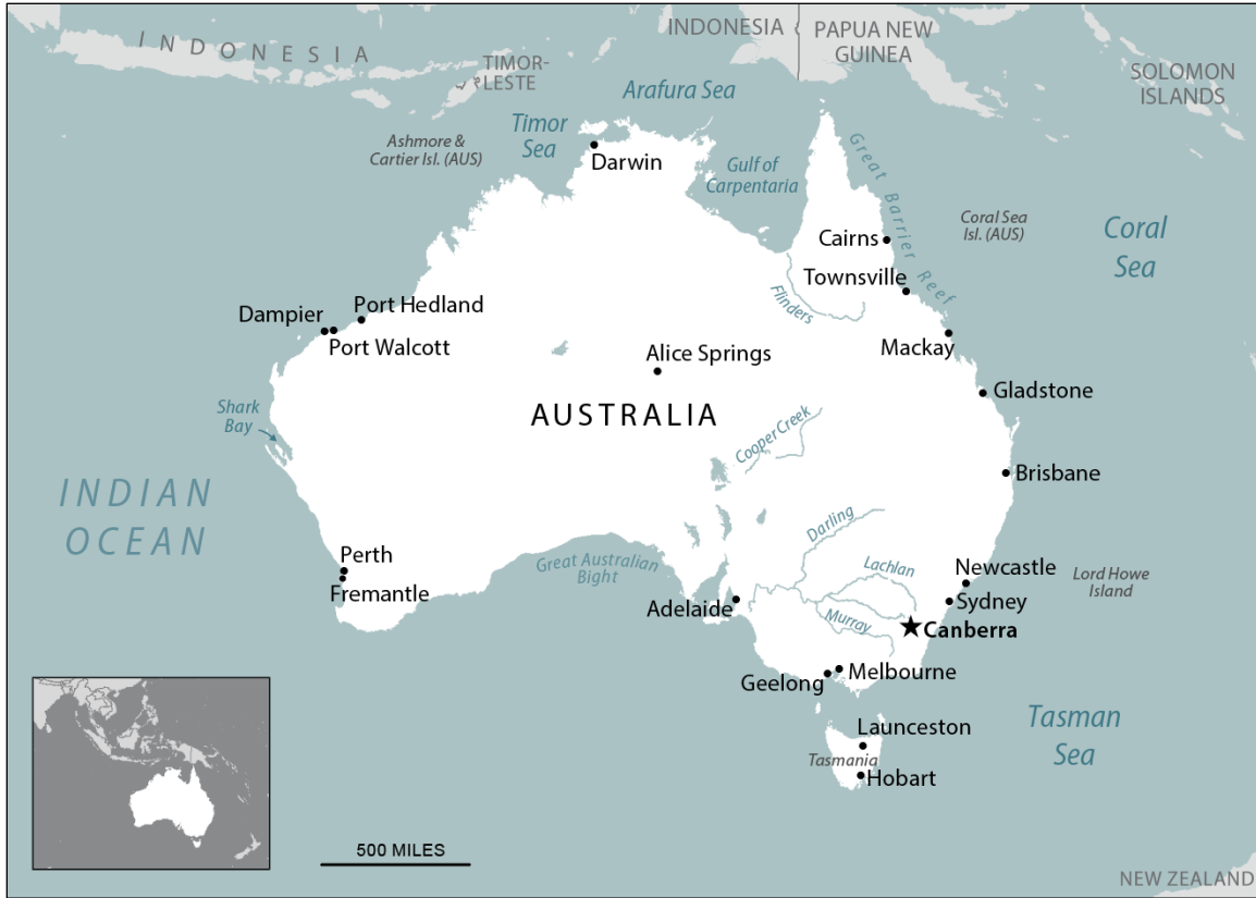
Figure 2. Map of Australia