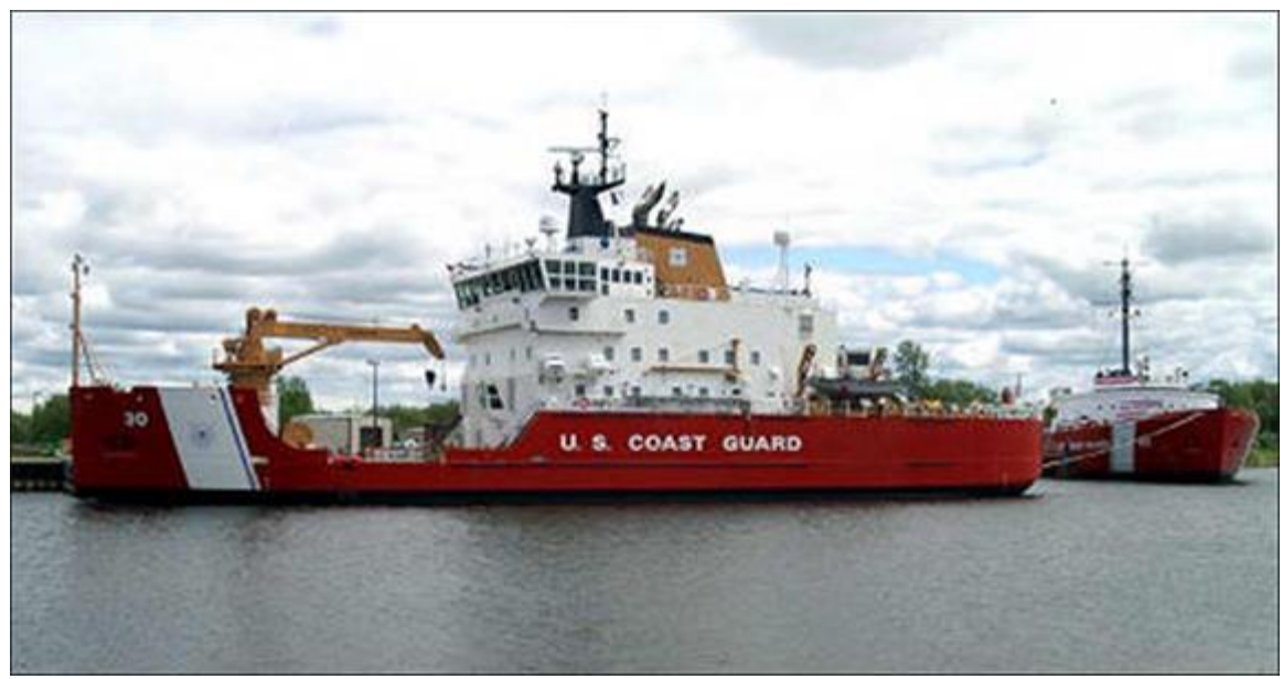
Figure C-1. Great Lakes Icebreaker Mackinaw