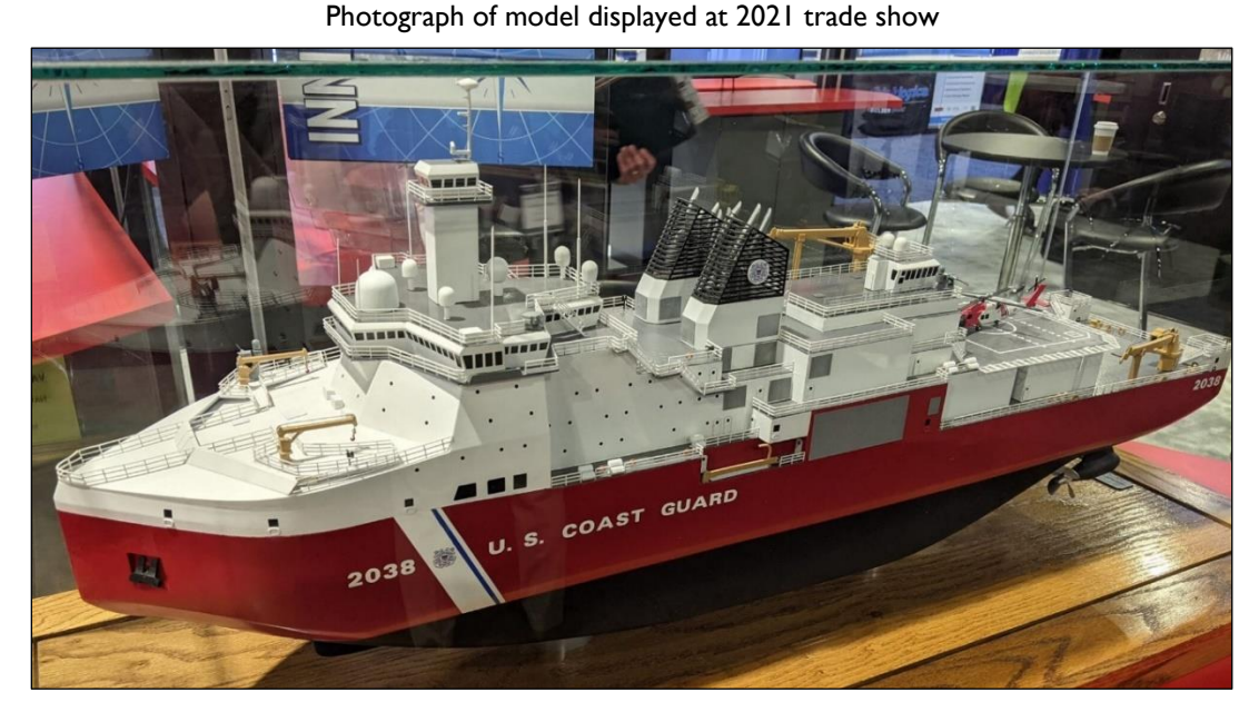
Figure 2. Model of Halter Marine Design for PSC