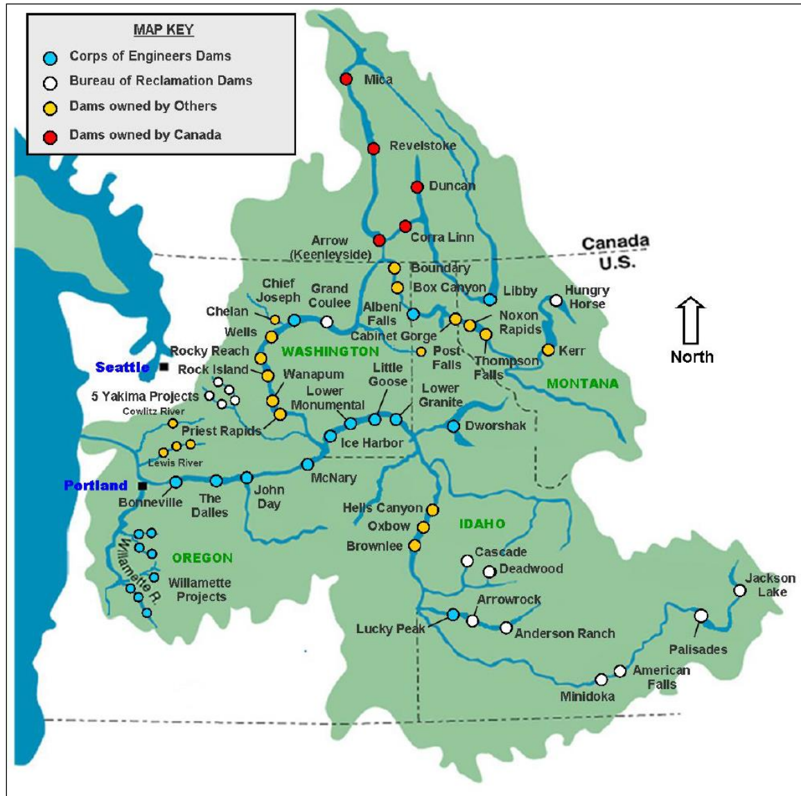
Figure 1. Columbia River Basin and Dams