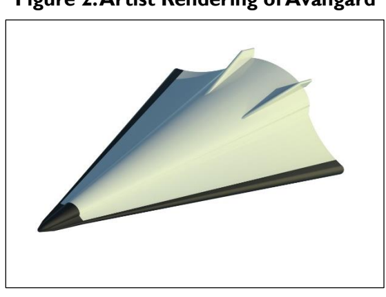
Figure 2. Artist Rendering of Avangard

Avangard ( Figure 2 ) is a hypersonic glide vehicle launched from an intercontinental ballistic missile (ICBM), giving it "effectively 'unlimited' range." Reports indicate that Avangard is currently deployed on the SS-19 Stiletto ICBM, though Russia plans to eventually launch the vehicle from the Sarmat ICBM. Sarmat is still in development, although it was successfully tested in April 2022 and is scheduled to be deployed by the end of 2022. Avangard features onboard countermeasures and will reportedly carry a nuclear warhead. It was successfully tested twice in 2016 and once in December 2018, reportedly reaching speeds of Mach 20; however, an October 2017 test resulted in failure. Russian news sources claim that Avangard entered into combat duty in December 2019.