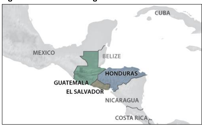
Figure I. Northern Triangle of Central America

According to a model developed at the University of Texas at Austin, an estimated 377,000 people, on average, left the Northern Triangle region of Central America (see Figure 1 ) annually from FY2018 to FY2021, with the majority bound for the United States. Flows have varied from year to year, with an estimated 651,000 people leaving the region in FY2019, followed by 92,400 in FY2020, and 486,600 in FY2021. Surveys conducted in 2020 found many potential migrants had postponed their plans in the midst of the Coronavirus Disease 2019 (COVID-19) pandemic but intended to undertake their journeys once governments lifted cross-border travel restrictions.