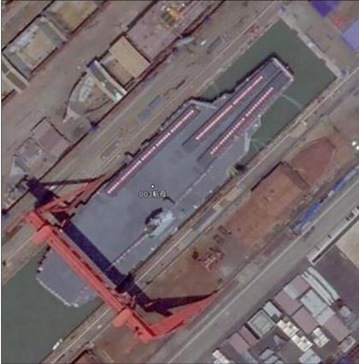
Figure 14. Fujian (Type 003) Aircraft Carrier

Source: Cropped version of photograph accompanying David Rising and Ken Moritsugu, “China Launches High-Tech Aircraft Carrier in Naval Milestone,” Associated Press, June 17, 2022. The caption to the photograph states, “This satellite image from Planet Labs PBC shows China’s new Type 003 aircraft carrier with bunting on its deck preparing to be launched Wednesday, June 15, 2022, from a shipyard in Shanghai, China. China on Friday, June 17, 2022, launched its third aircraft carrier, the first such ship to be designed and built entirely within the country. (Planet Labs PBC via AP)”