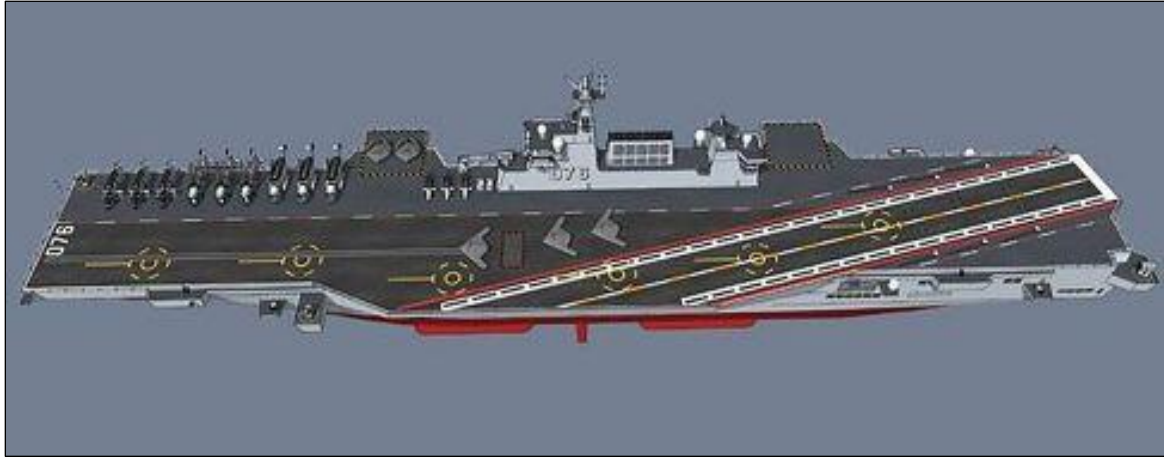
Figure 27. Notional Rendering of Possible Type 076 Amphibious Assault Ship