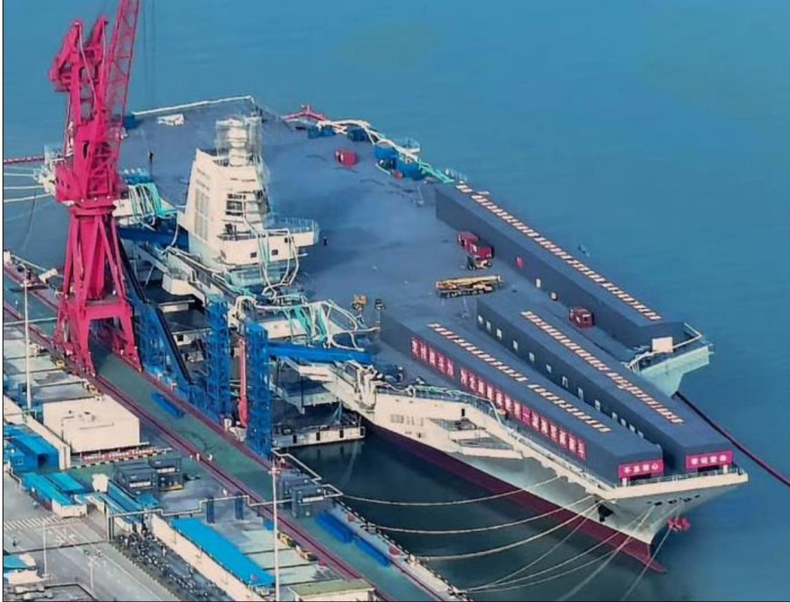
Figure 13. Fujian (Type 003) Aircraft Carrier