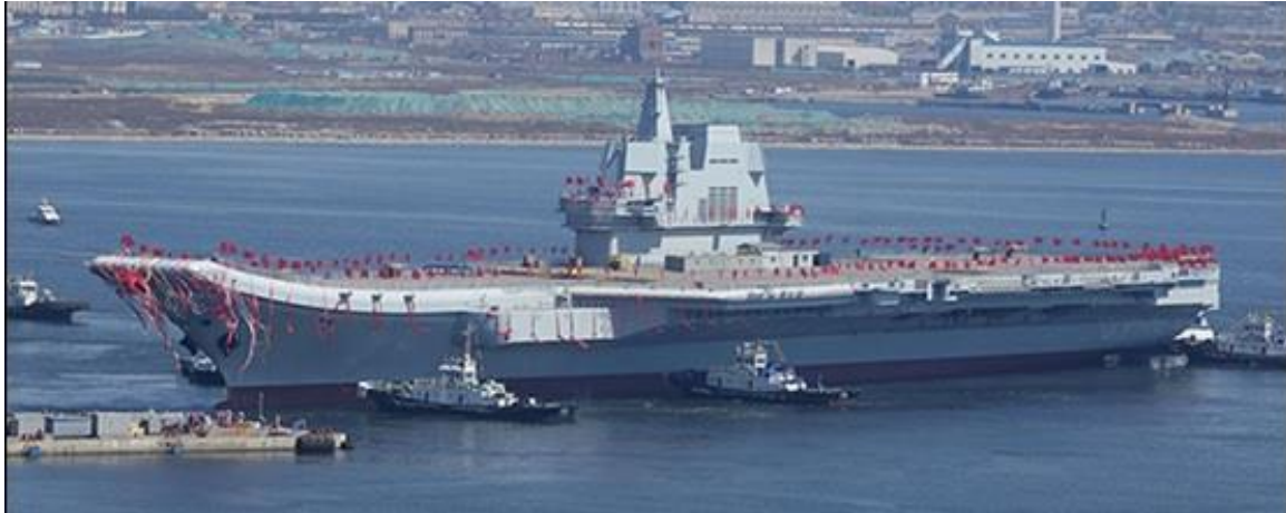
Figure 11. Shandong (Type 002) Aircraft Carrier