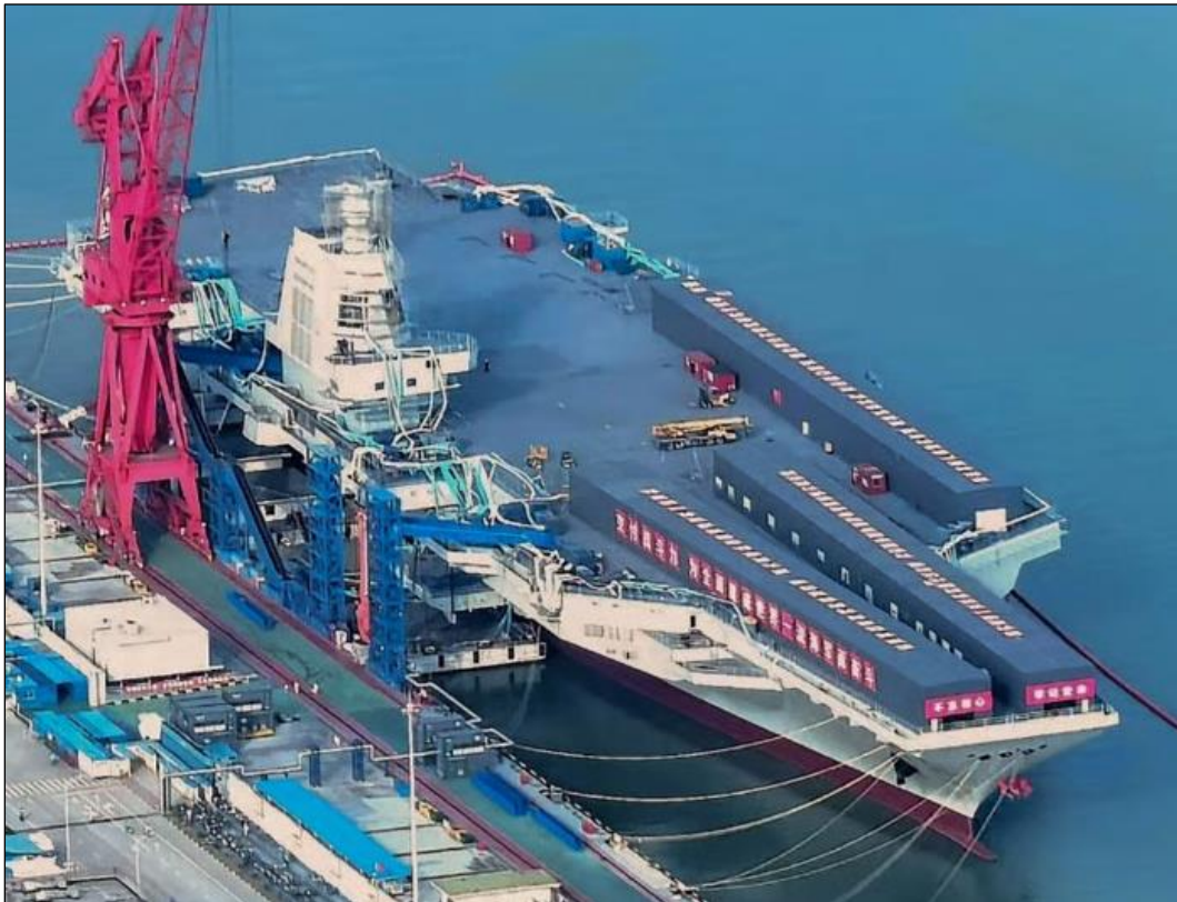
Figure 13. Fujian (Type 003) Aircraft Carrier