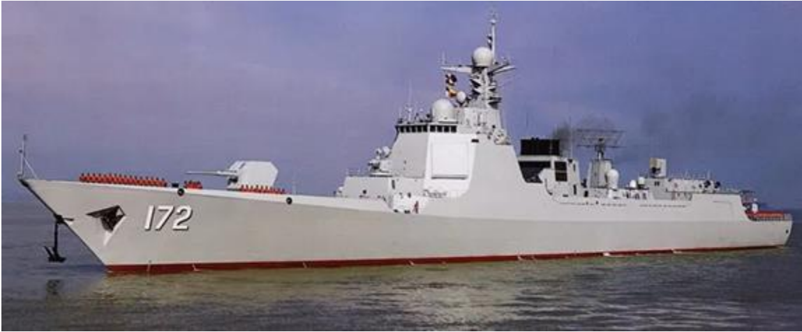
Figure 19. Luyang III (Type 052D) Destroyer