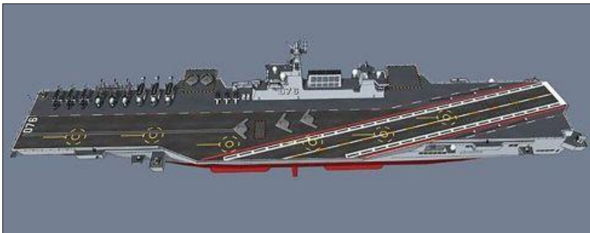
Figure 26. Notional Rendering of Possible Type 076 Amphibious Assault Ship