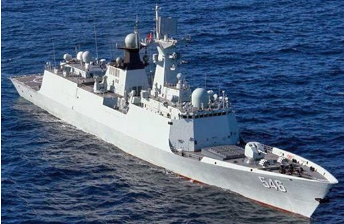
Figure 20. Jiangkai II (Type 054A) Frigate