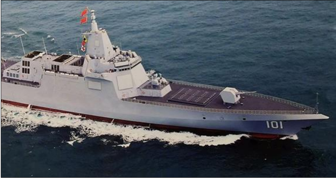
Figure 17. Renhai (Type 055) Cruiser (or Large Destroyer)