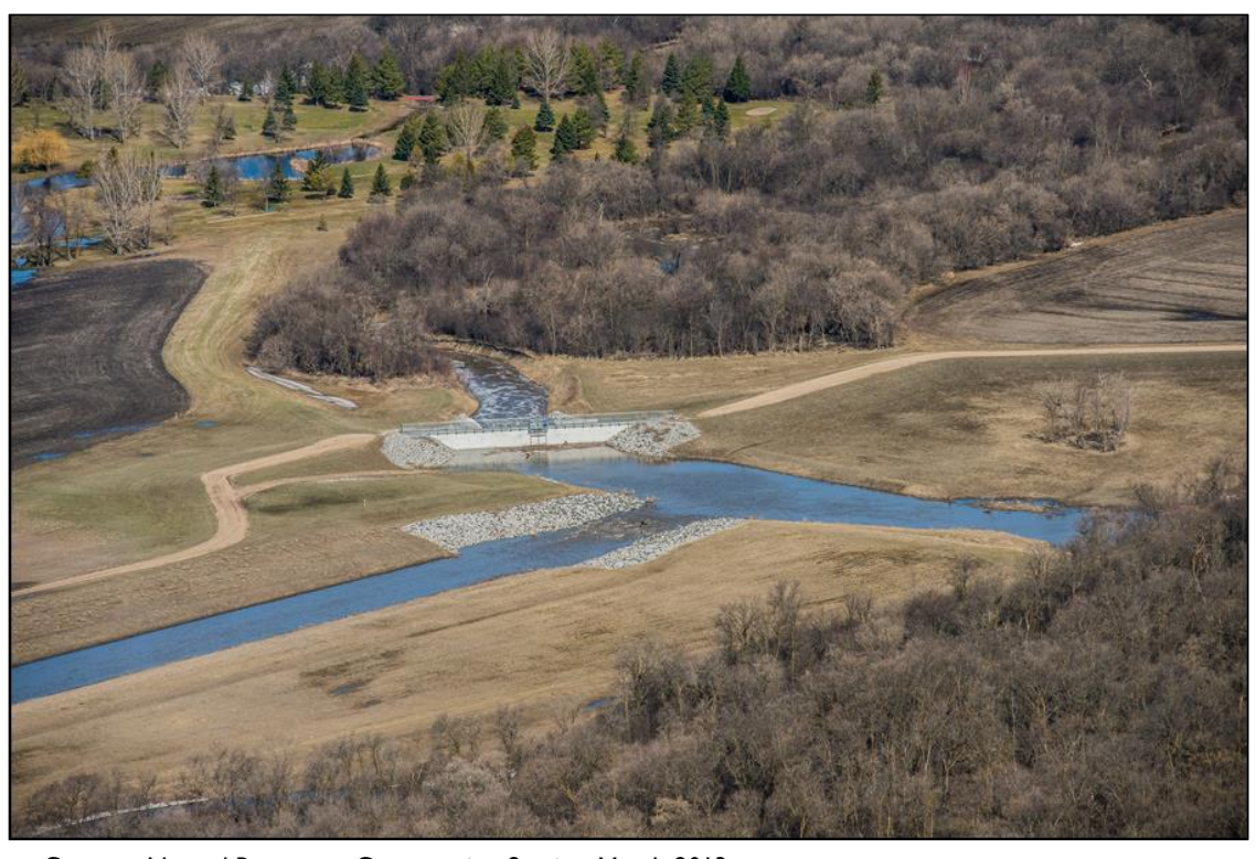
Figure 5. Example of a Watershed and Flood Prevention Operations (WFPO) Project