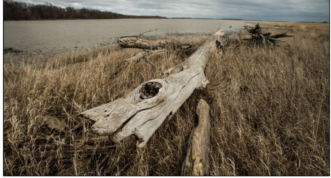
Figure 4. Example of an Emergency Watershed Protection (EWP) Floodplain Easement