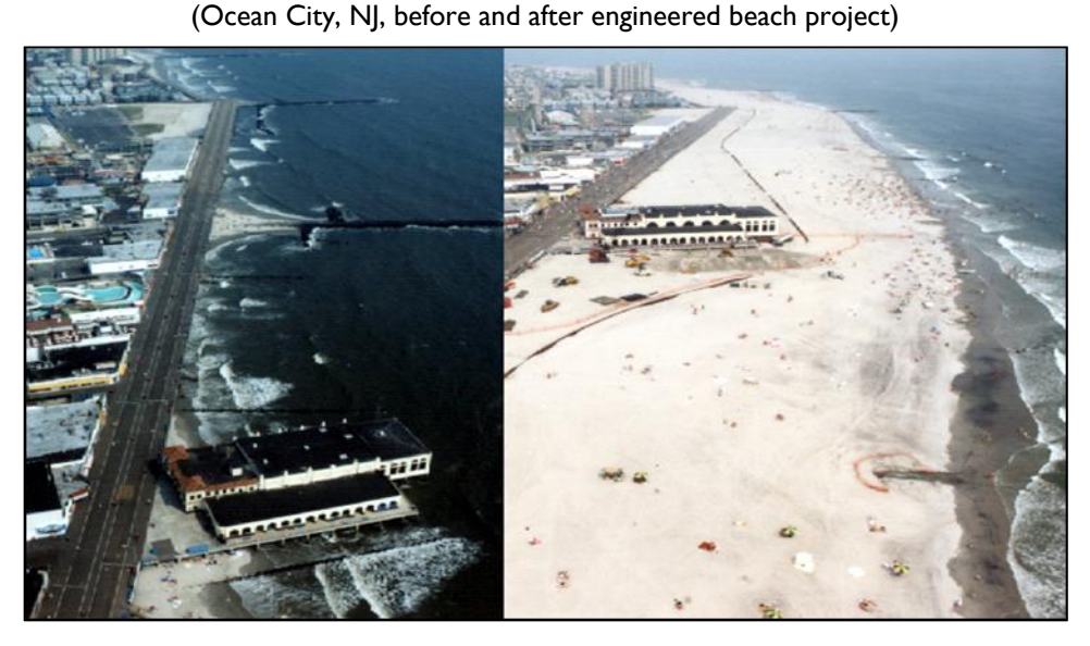
Figure 3. Example of Beach Engineered to Reduce Flood Damages