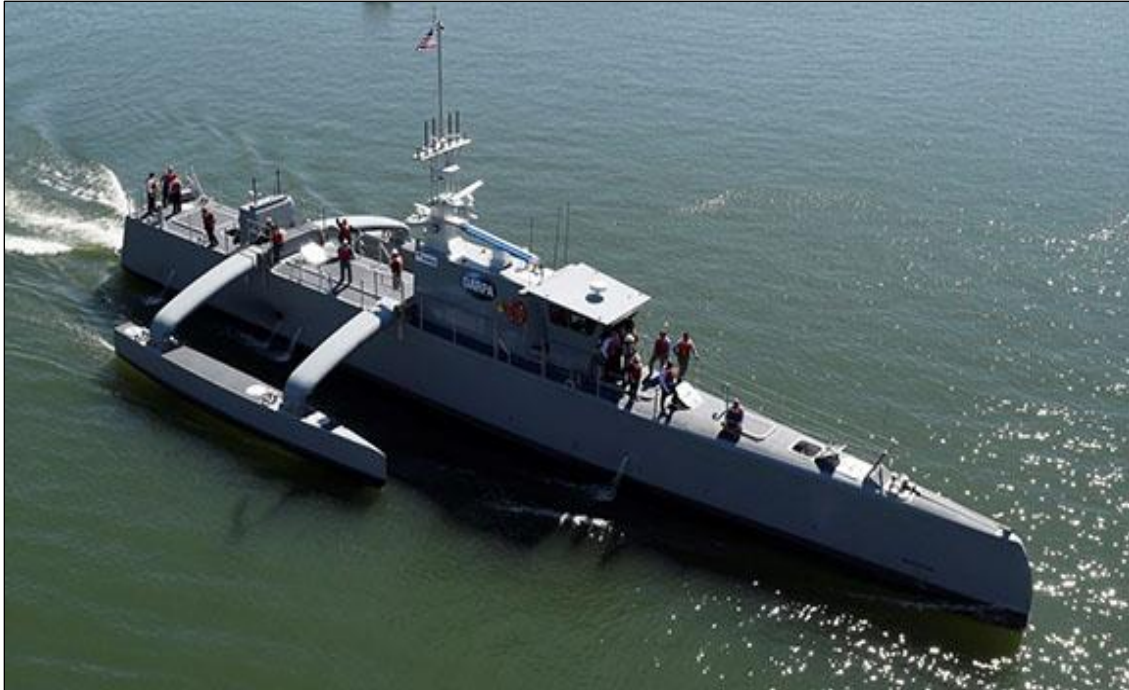
Figure 2. Sea Hunter Prototype Medium Displacement USV