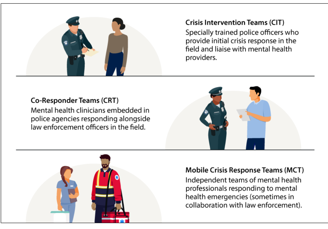
Figure 1. Common Models of Mental Health Crisis Response