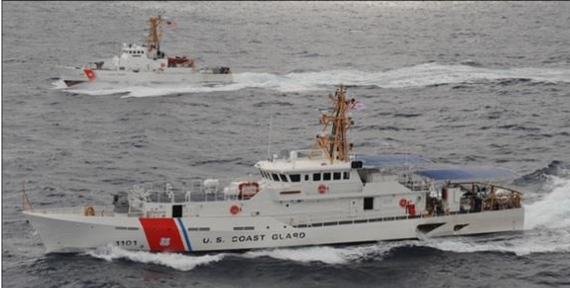
Figure 8. Fast Response Cutter With an older Island-class patrol boat behind