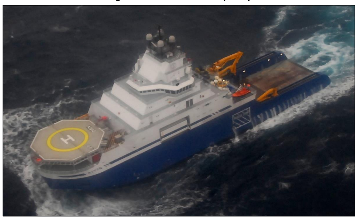
Figure A-8. Commercial Ship Aiviq

Source: Cropped version of photograph accompanying "Aiviq," Wikipedia, accessed April 29, 2022, which states that the photograph is dated December 30, 2012, and credits the photograph to U.S. Coast Guard Petty Officer 3rd Class Chris Usher.