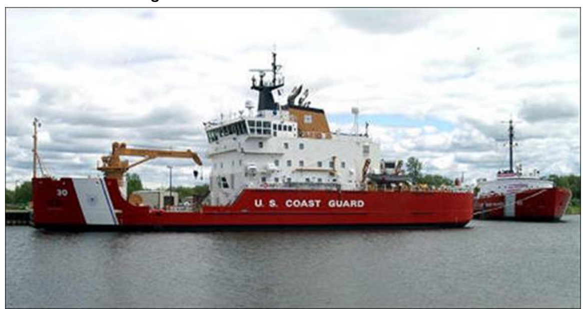
Figure C-1. Great Lakes Icebreaker Mackinaw