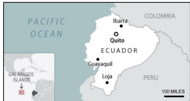
Figure 1. Ecuador at a Glance

Area: 109,483 square miles, slightly smaller than Nevada