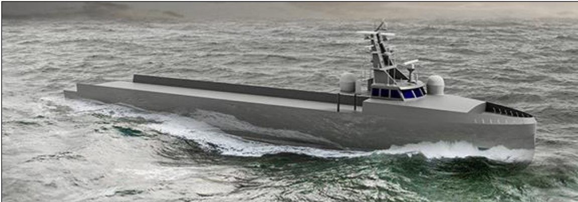
Figure 6. Rendering of L3Harris Design Concept for MUSV