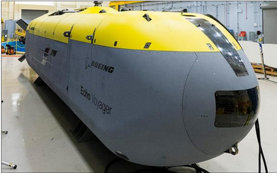
Figure 7. Boeing Echo Voyager UUV