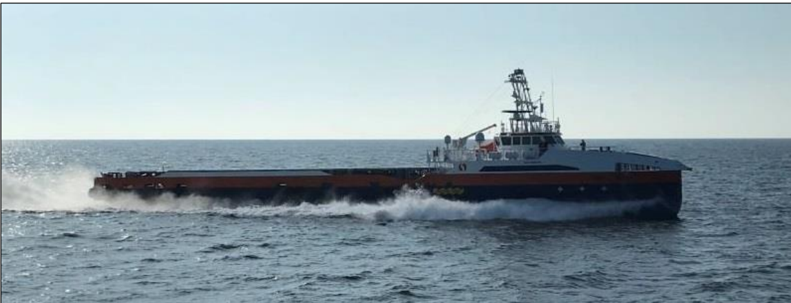
Figure 4. LUSV Prototype