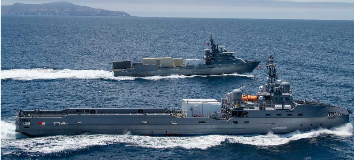
Figure 3. USV Prototypes