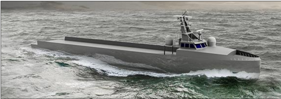
Figure 6. Rendering of L3Harris Design Concept for MUSV