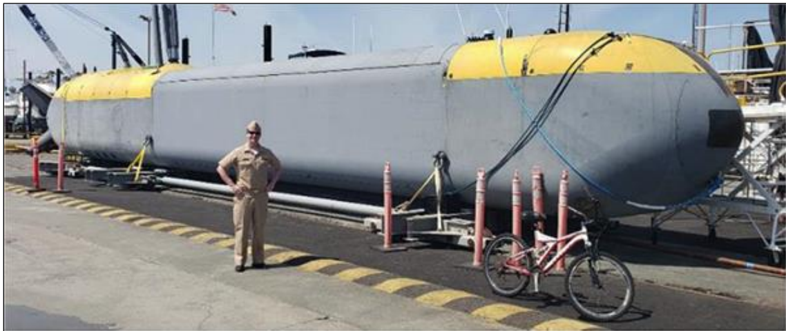
Figure 9. Boeing Echo Voyager UUV