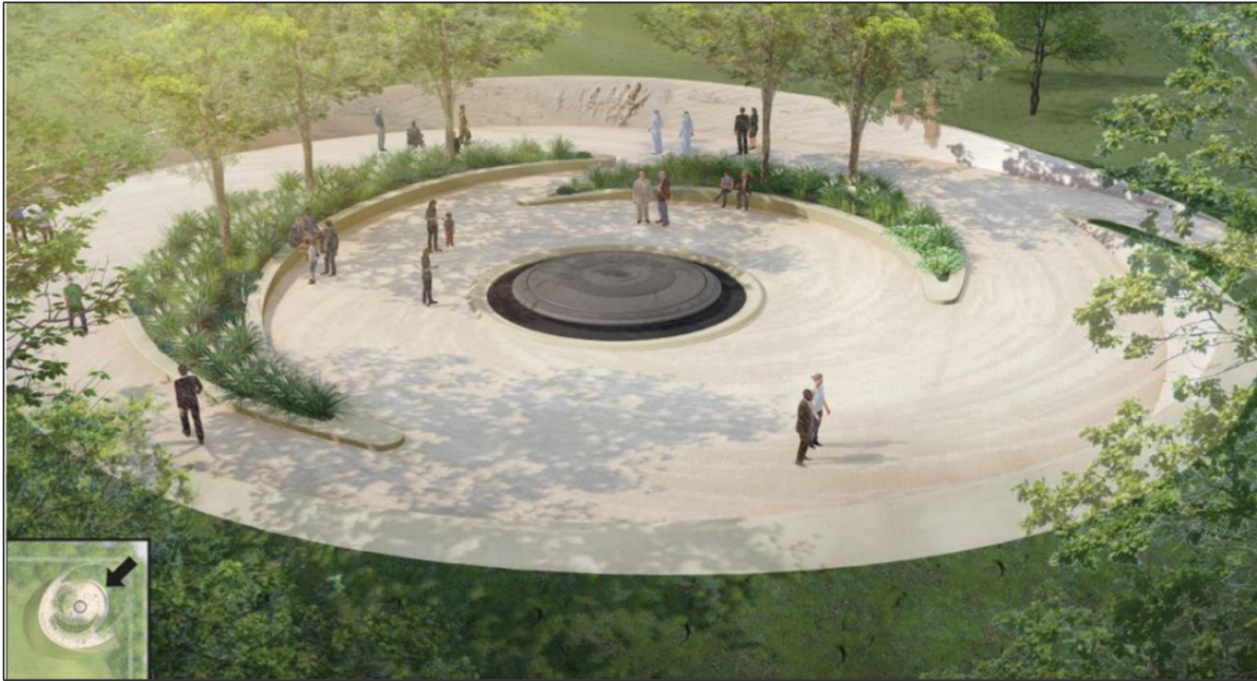
Figure 2. National Desert Storm and Desert Shield War Memorial Approved Preliminary Plan