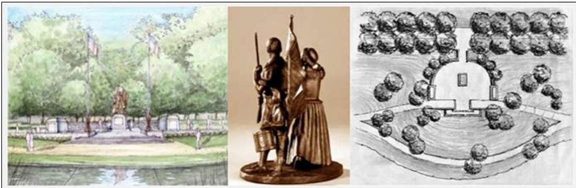
Figure 8. Slaves and Free Black Persons Who Served in the Revolutionary War Concept Design