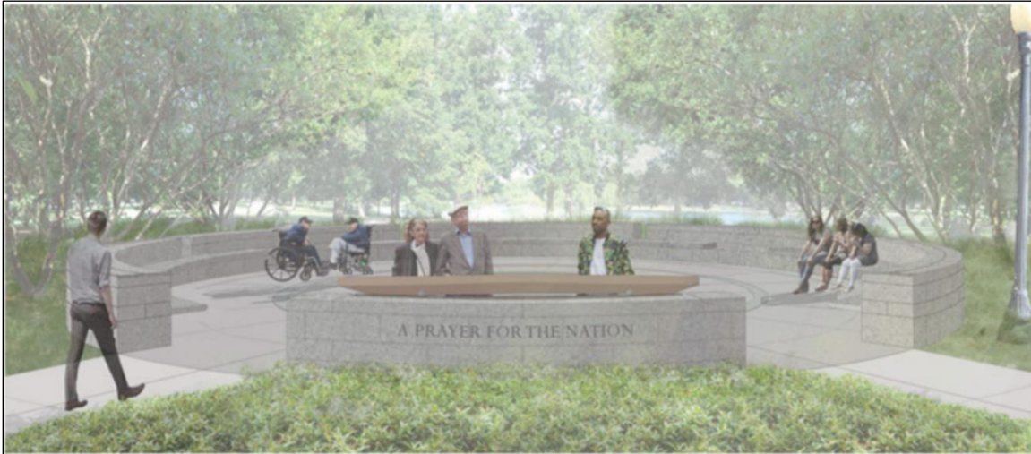
Figure 3. World War II D-Day Prayer Plaque Approved Design

Source: Friends of the National World War II Memorial, Inc, “Presentation to the Commission of Fine Arts (Commemorative Feature Details and Revisions)” January 20, 2022, p. 1, at https://cfa.gov/system/files/meeting-materials/I_CFA-20-JAN-22-1%20%28NPS-WWII%29%20pres-sm%20%5B1-19%20update%5D.pdf .