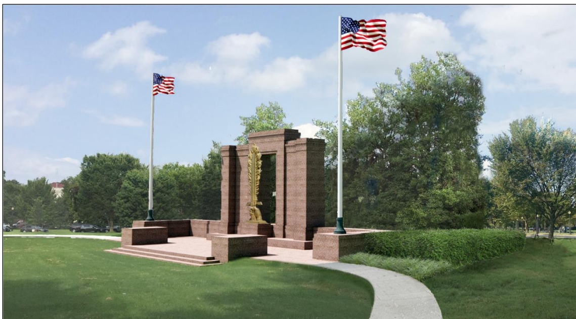
Figure 4. Second Division Memorial

Source: Second Infantry Division Association Memorial Foundation, "Second Infantry Division Memorial Modification," CFA Submission, November 19, 2020, p. 21, at https://www.cfa.gov/system/files/meeting-materials/CFA-19NOV20-2-Second_Division_Memorial_%28pres%29.pdf .