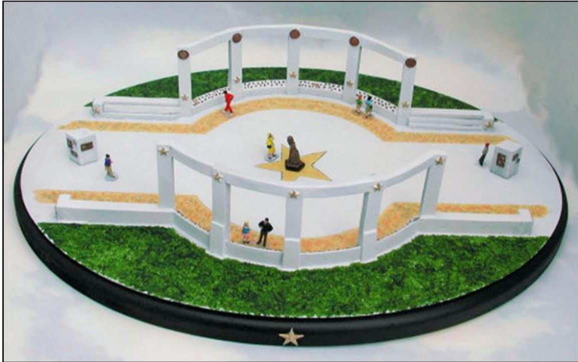
Figure 7. Gold Star Mothers Memorial Concept Design