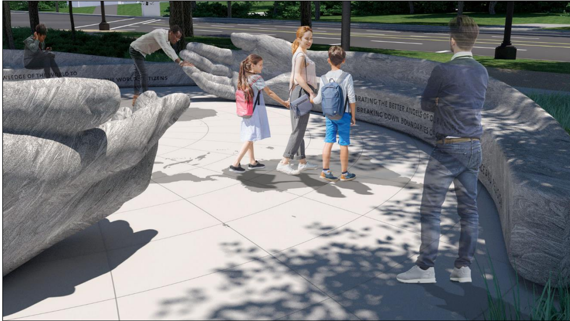
Figure 5. Peace Corps Memorial Concept Design