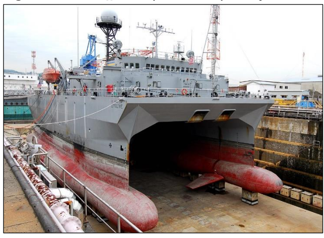
Figure 2. USNS Effective (TAGOS-21) in Dry Dock